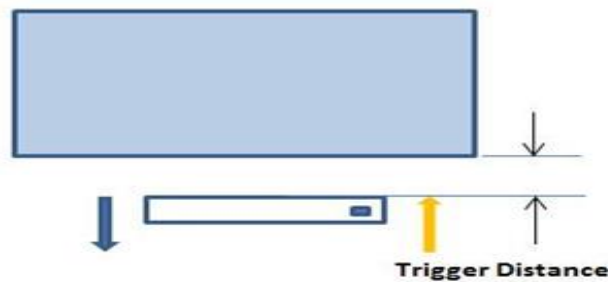
Proximity Sensor Trigger Distance Assessment KDB 616217 §6.2, Rear

It was confirmed separately that the output power was altered according to the proximity sensor status indication. This was achieved by observing the proximity sensor status at the same time as monitoring the conducted power. Section 9 contains both the full and reduced conducted power measurements.