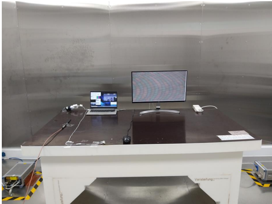
[ Mode 1 : Front ]