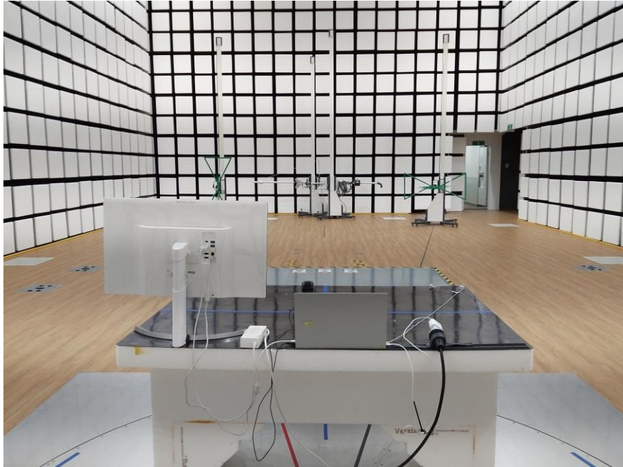
[ Mode 1 : Rear ]