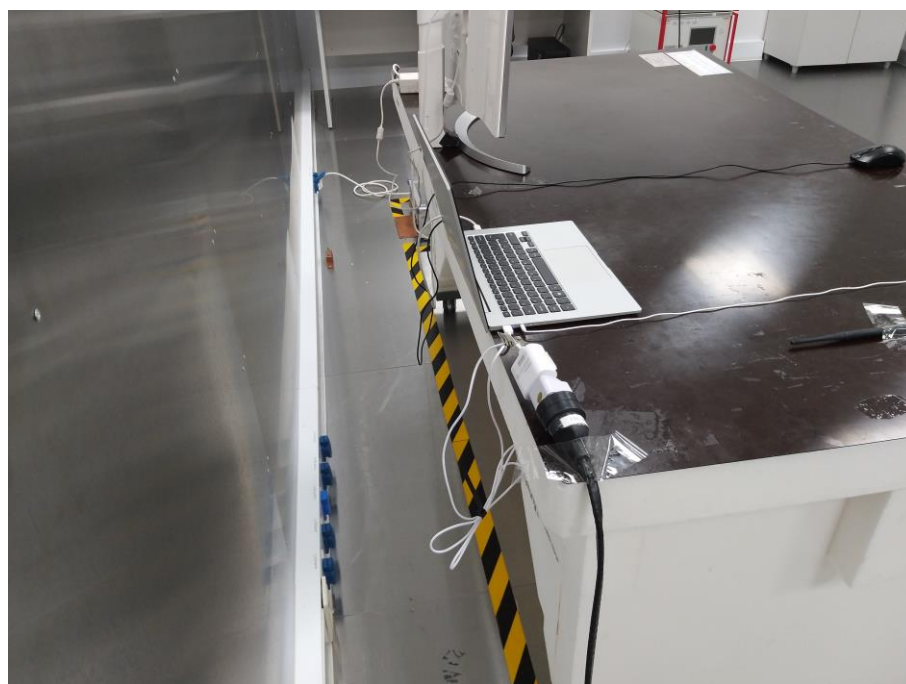
[ Mode 1 : Rear ]