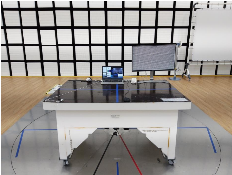
[ Mode 1 : Front ]