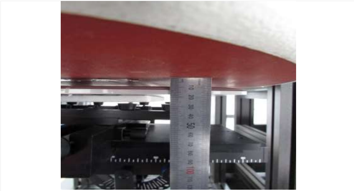
Distance of 9 mm from the EUT (WiFi ANT.2)