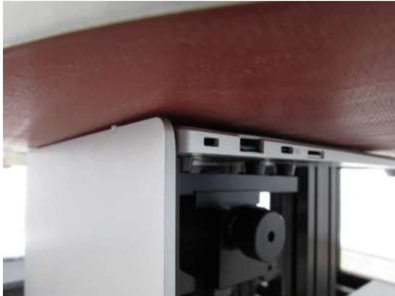
Distance of 0 mm from the EUT