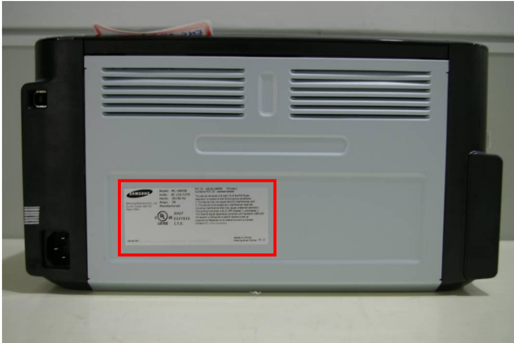
Rear View & Label location