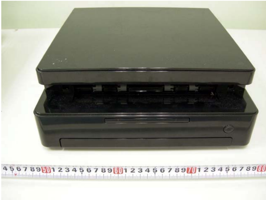
Fig 05 (ML-163****)