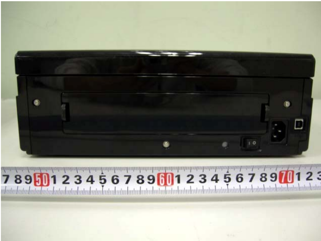
Fig 08 (ML-163****)