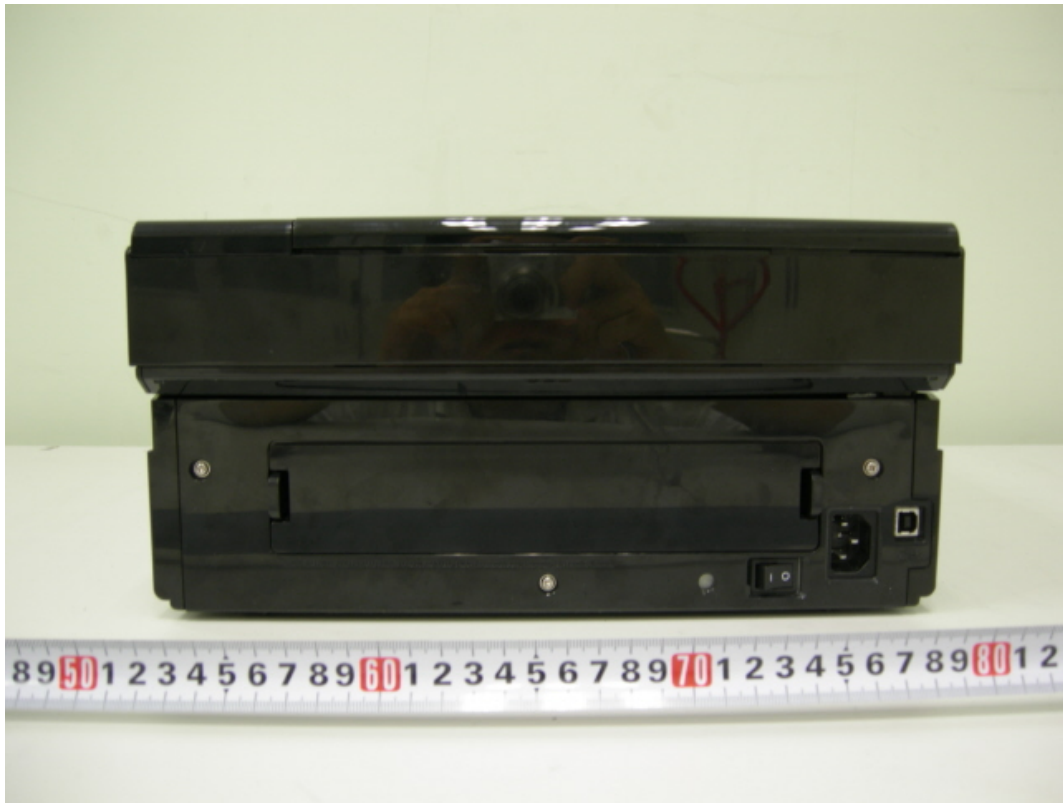
Fig 04 (SCX-4500***)