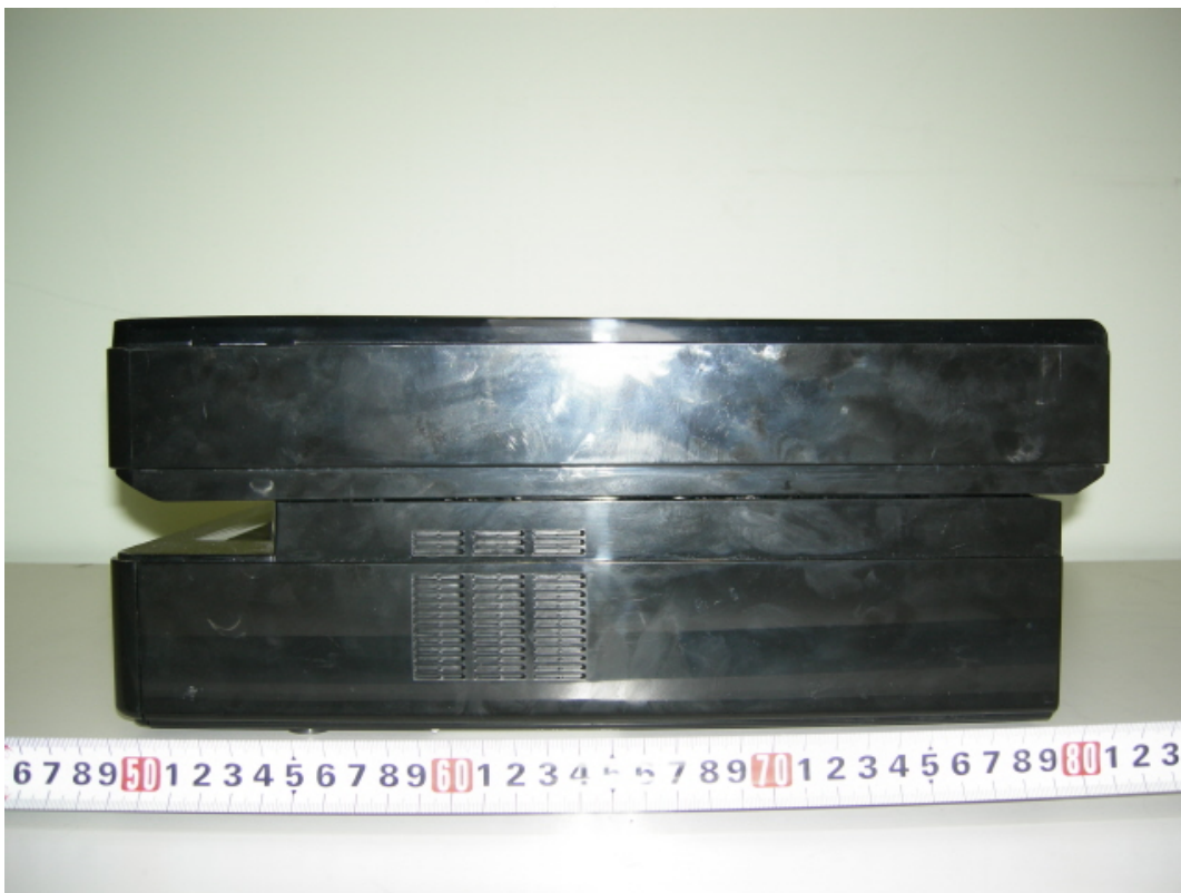
Fig 02 (SCX-4500***)