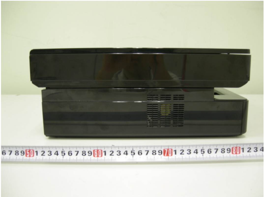
Fig 03 (SCX-4500***)