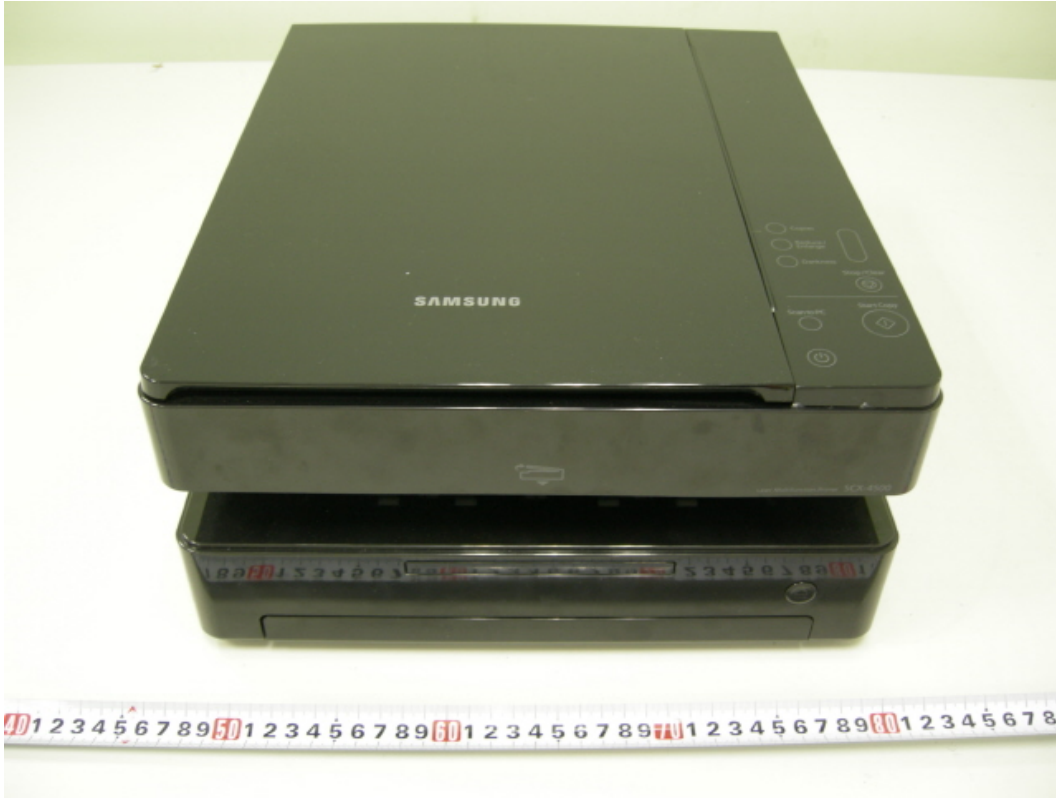
Fig 01 (SCX-4500***)