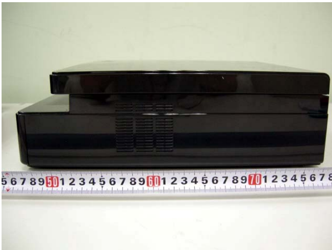
Fig 06 (ML-163****)