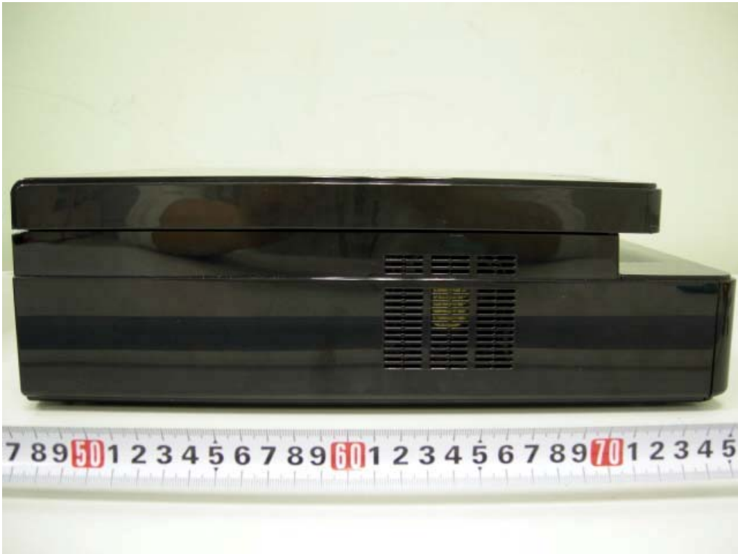
Fig 07 (ML-163****)