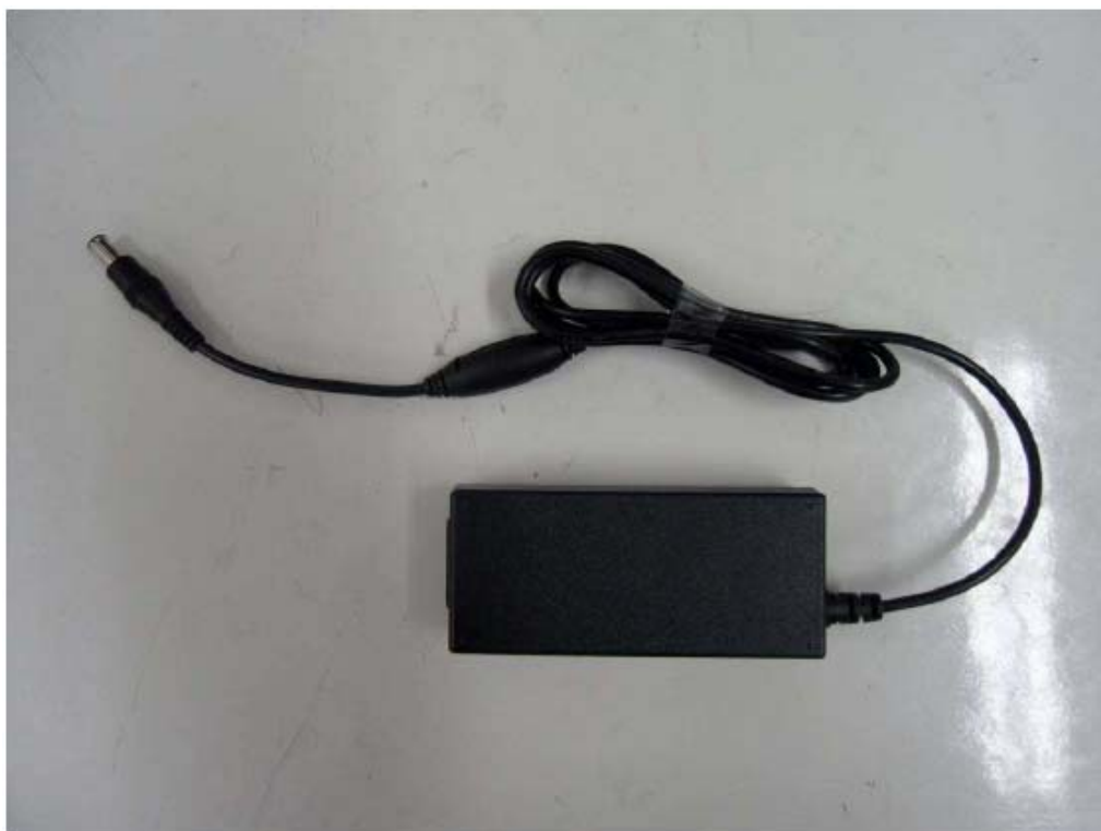
Before change A3514_DHS external rear view