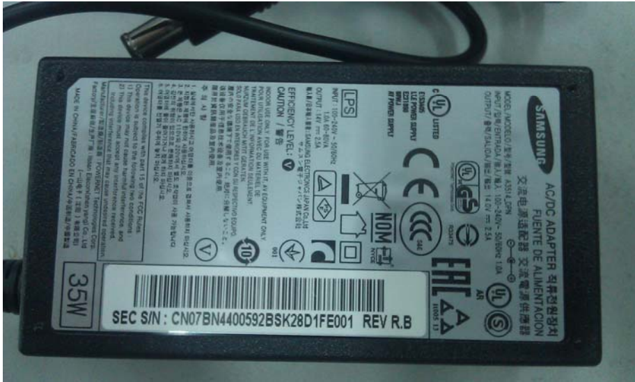
back change A3514_DPN external front view