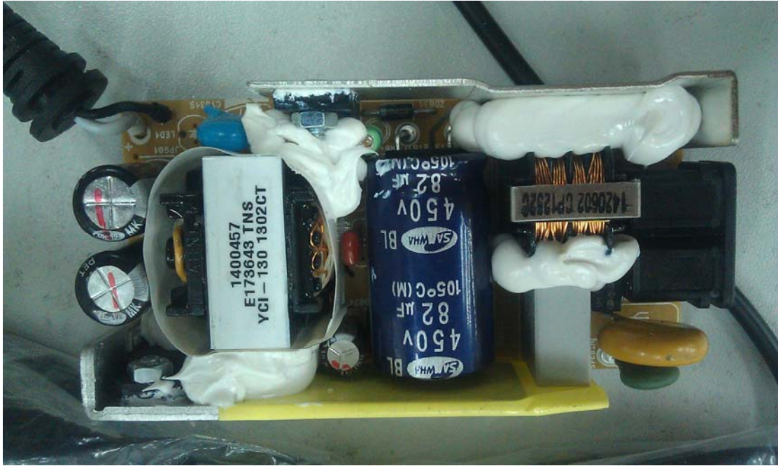
back change A3514_DPN internal front view