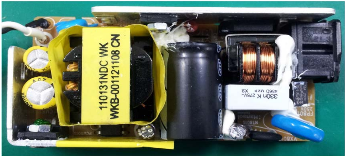
Before change A3514_DHS internal front view