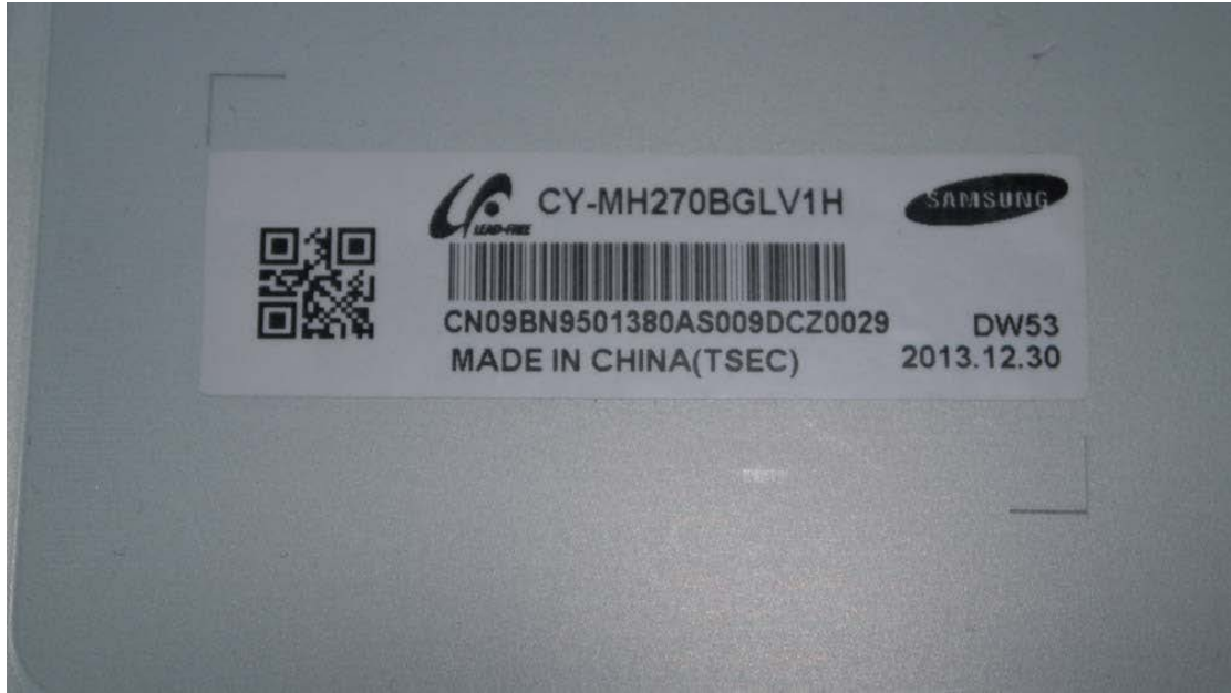
Before change MH270BGLV1H rear view