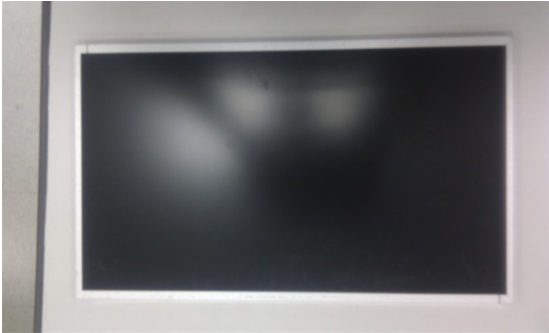
Before change MH270BGLV1H front view