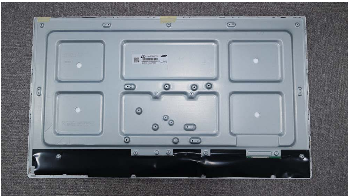
Before change MH270BGLV1H rear view