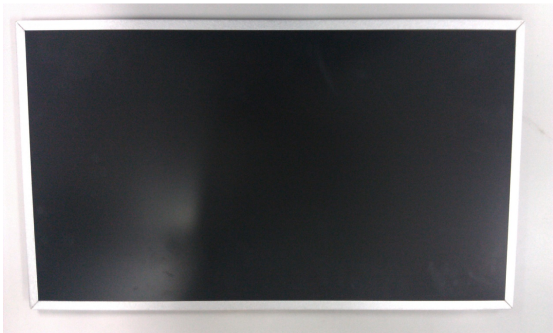
Back change M270HGE-L30 front view