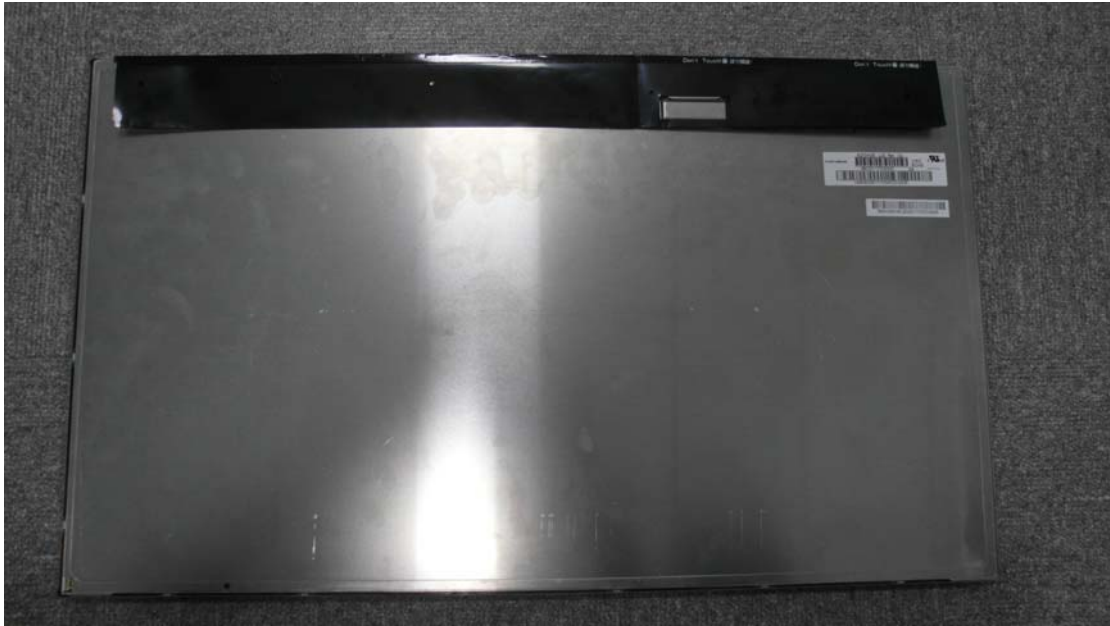
Back change M270HGE-L30 rear view