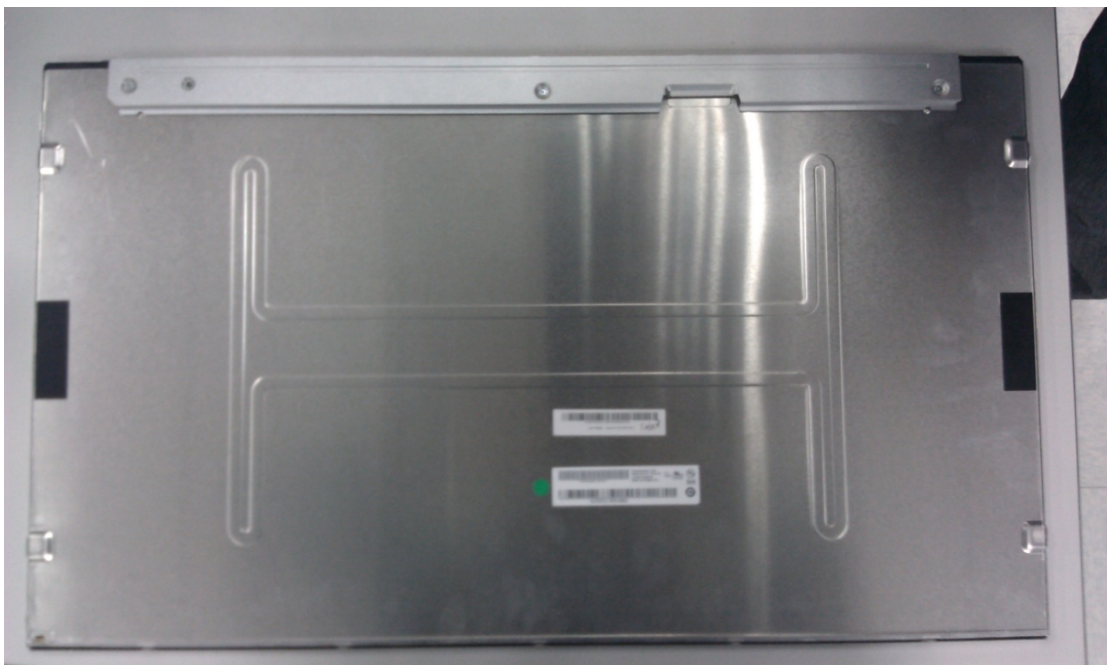
Before change M270HW01 rear view