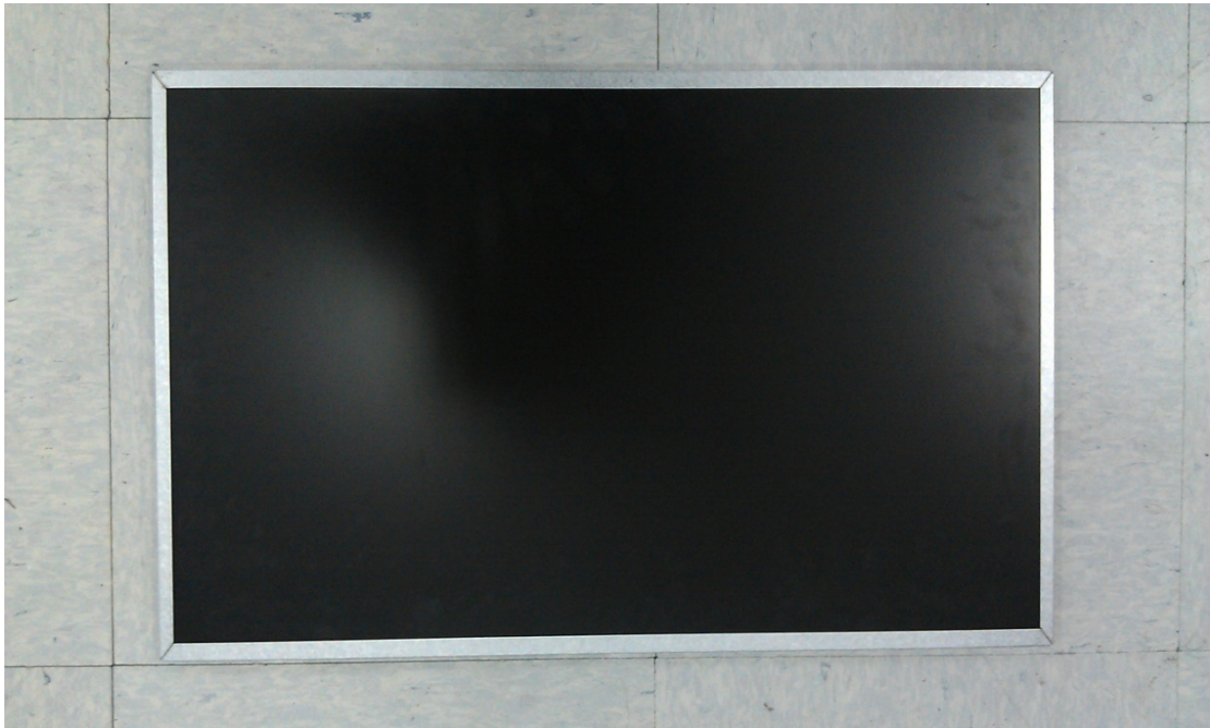
Before change M270HW01 front view