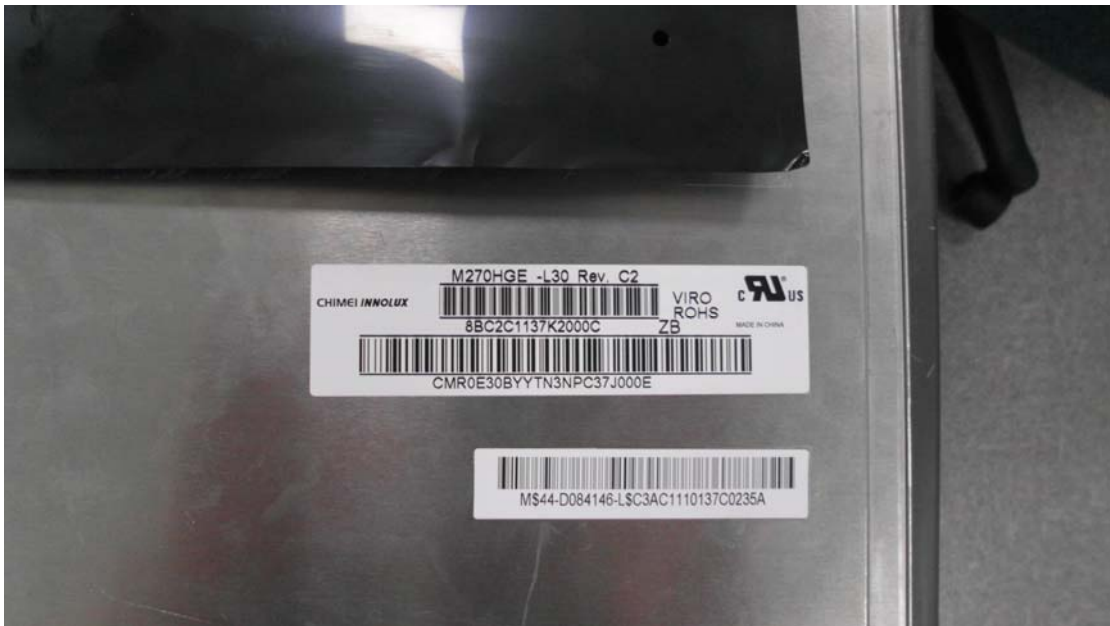
Back change M270HGE-L30 rear view