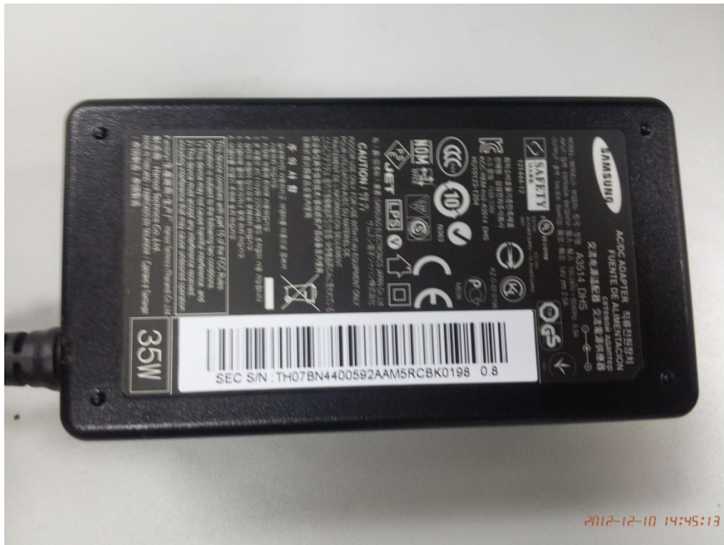
Before change A3514_DHS external front view