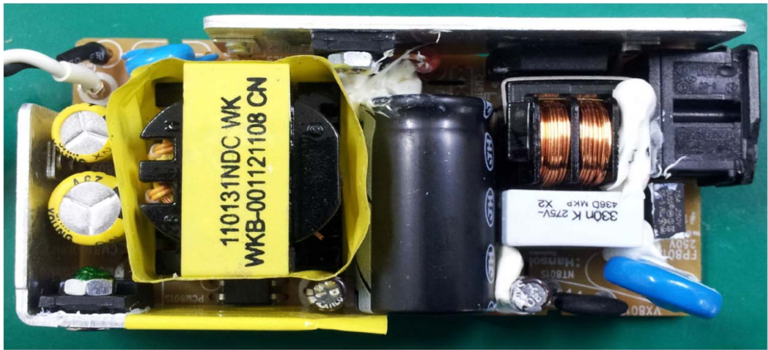
Before change A3514_DHS internal front view