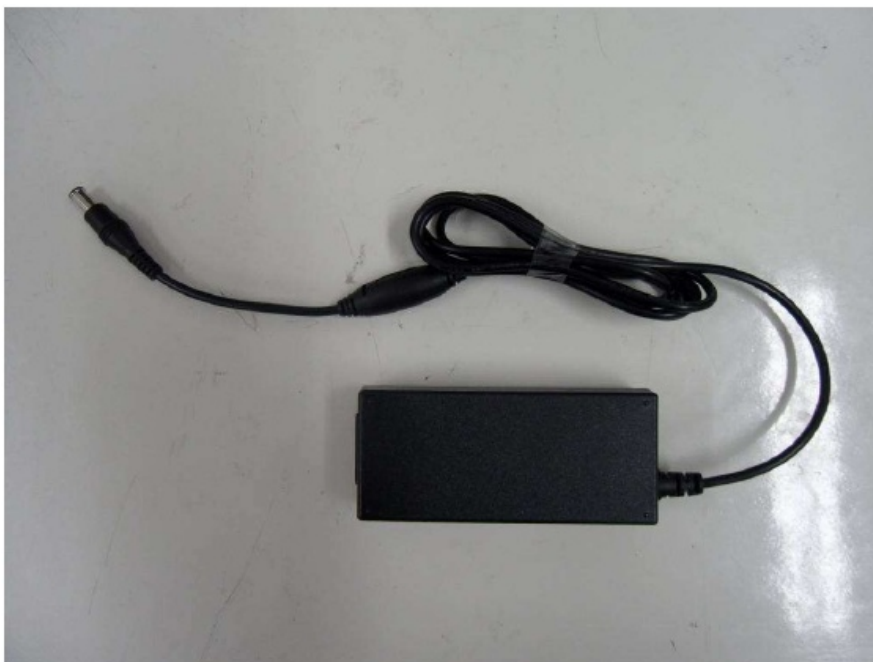
Before change A3514_DHS external rear view