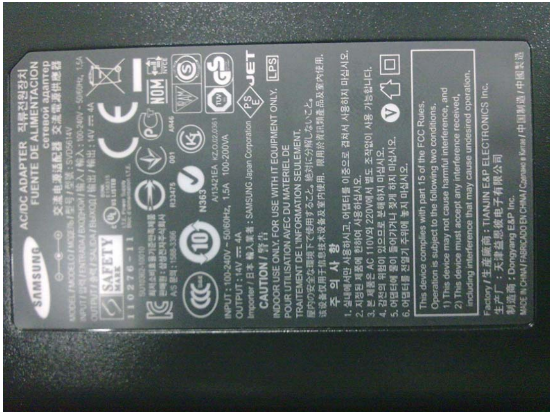
Back change SVD5614V front view