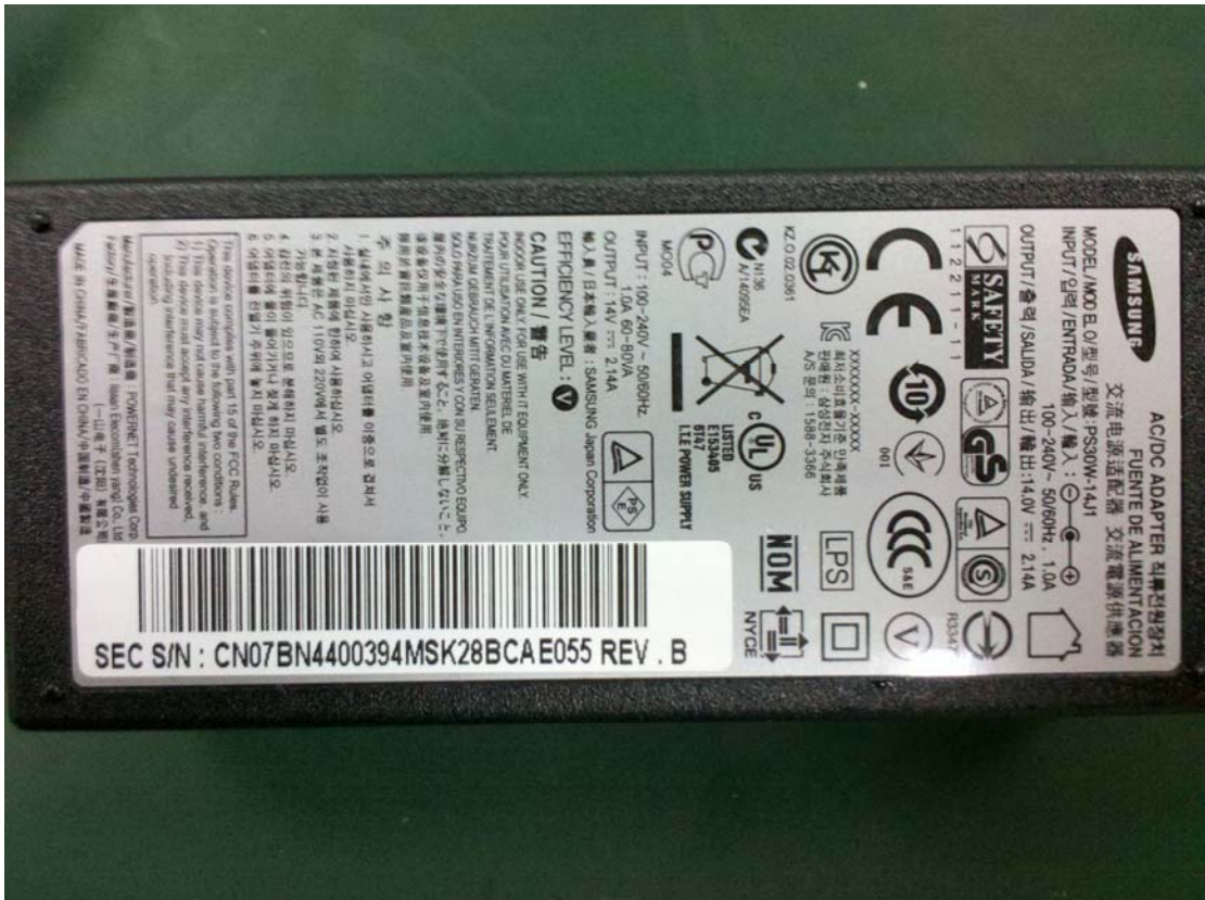
Back change PS30W-14J1 front view