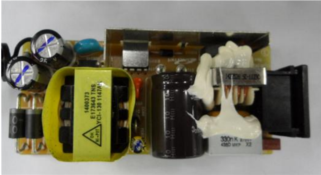
Back change PS30W-14J1 front view