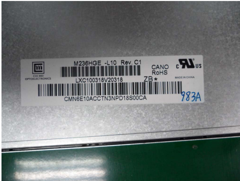
Before change M236HGE-L10 rear view