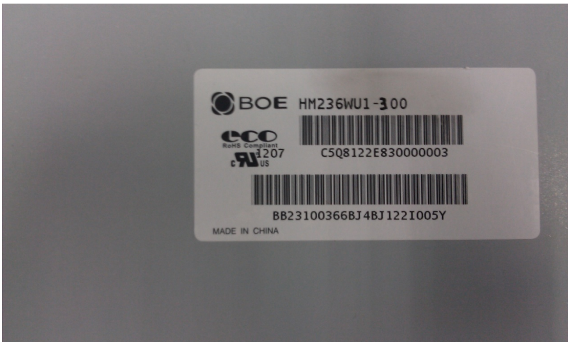
Back change HM236WU1-300 rear view