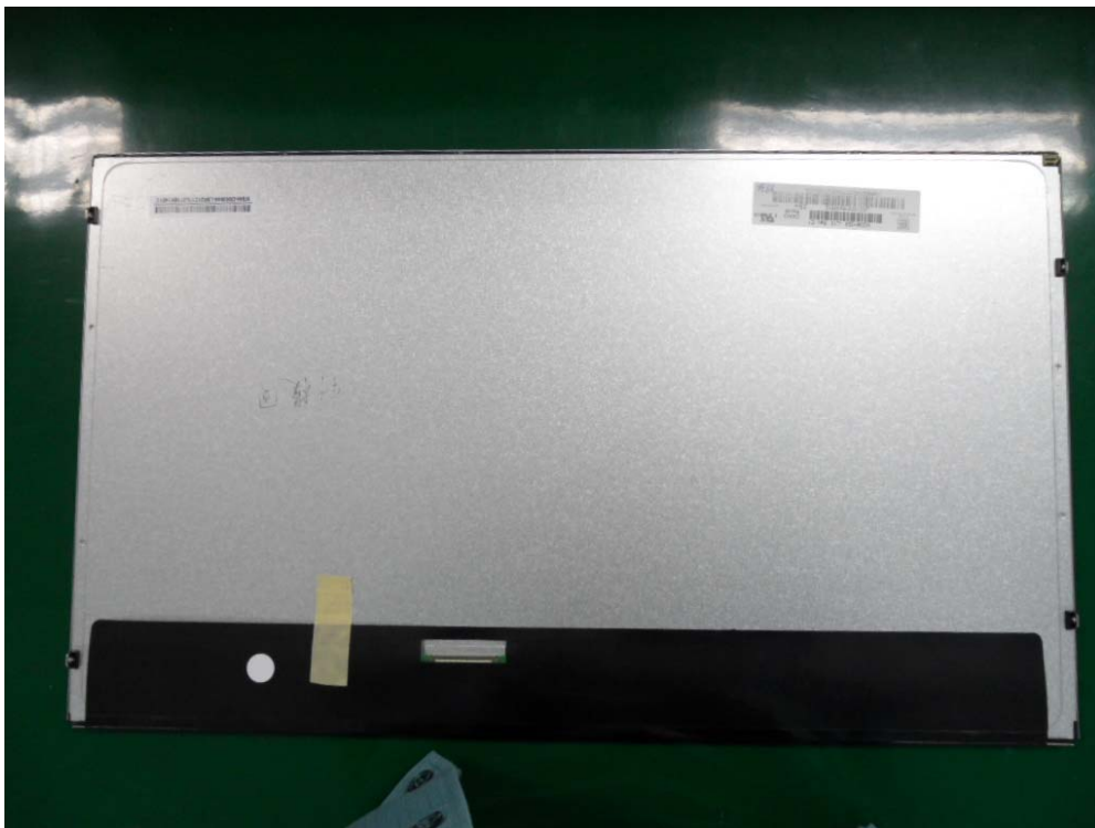
Before change M236HGE-L10 rear view