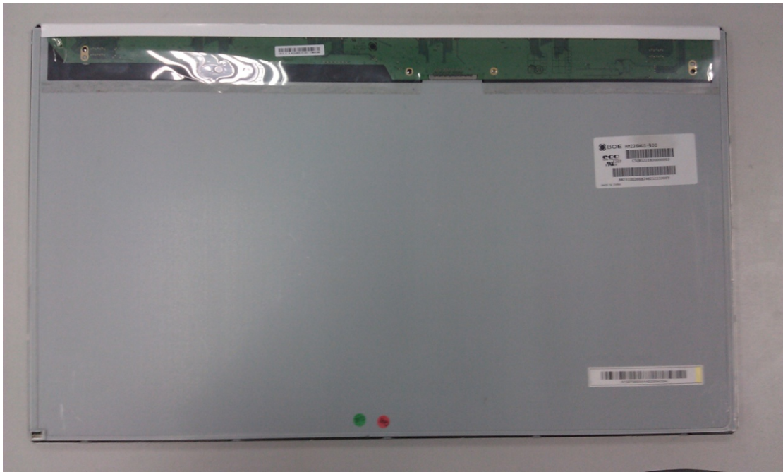
Back change HM236WU1-300 rear view