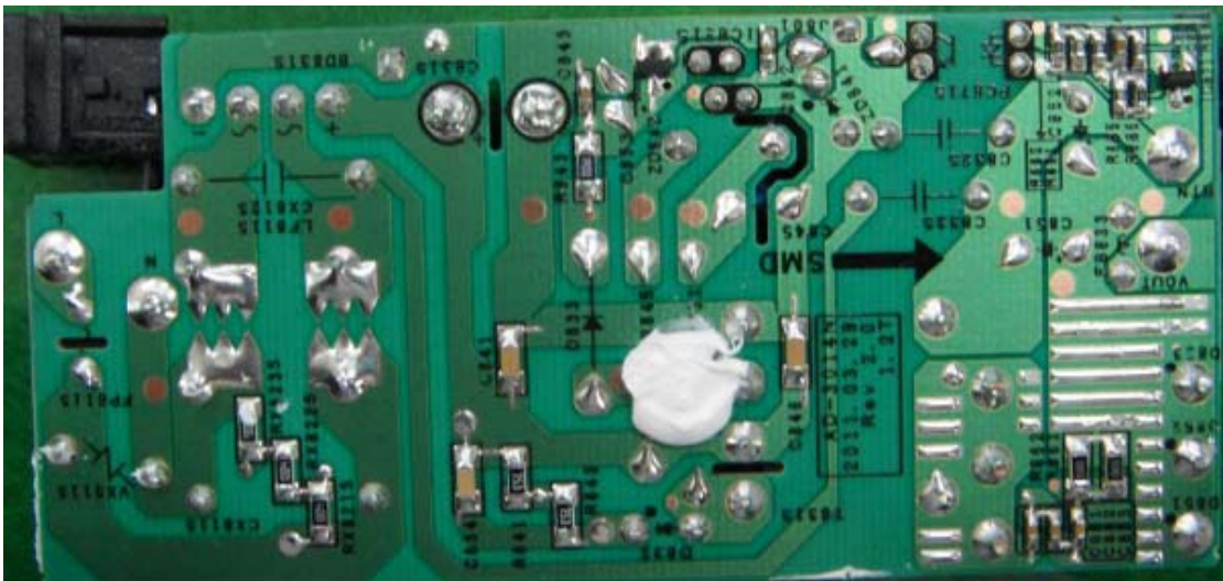
Before change AD-3014N rear view