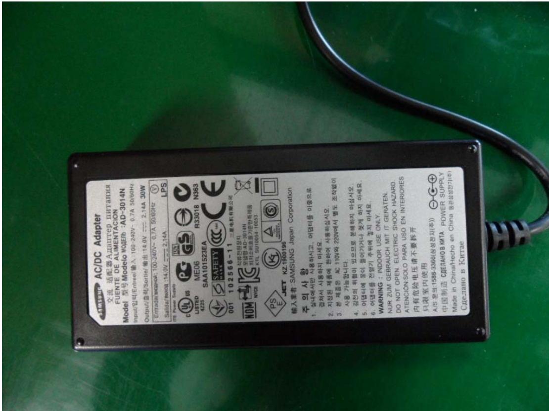
Before change AD-3014N front view