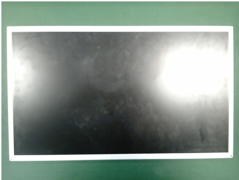
Back change HM236WU1-300 front view