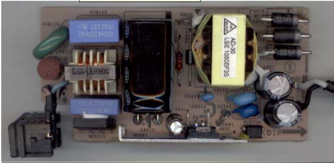
Before change AD-3014N front view