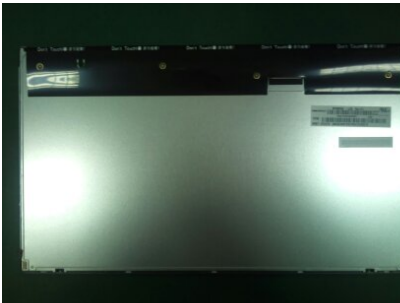
Before change M195FGE-L20 Internal rear view