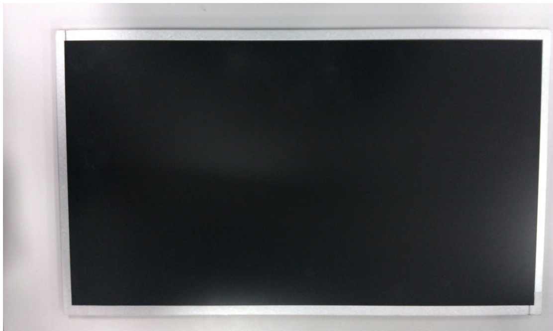
After change M195RTN01.0 Internal front view