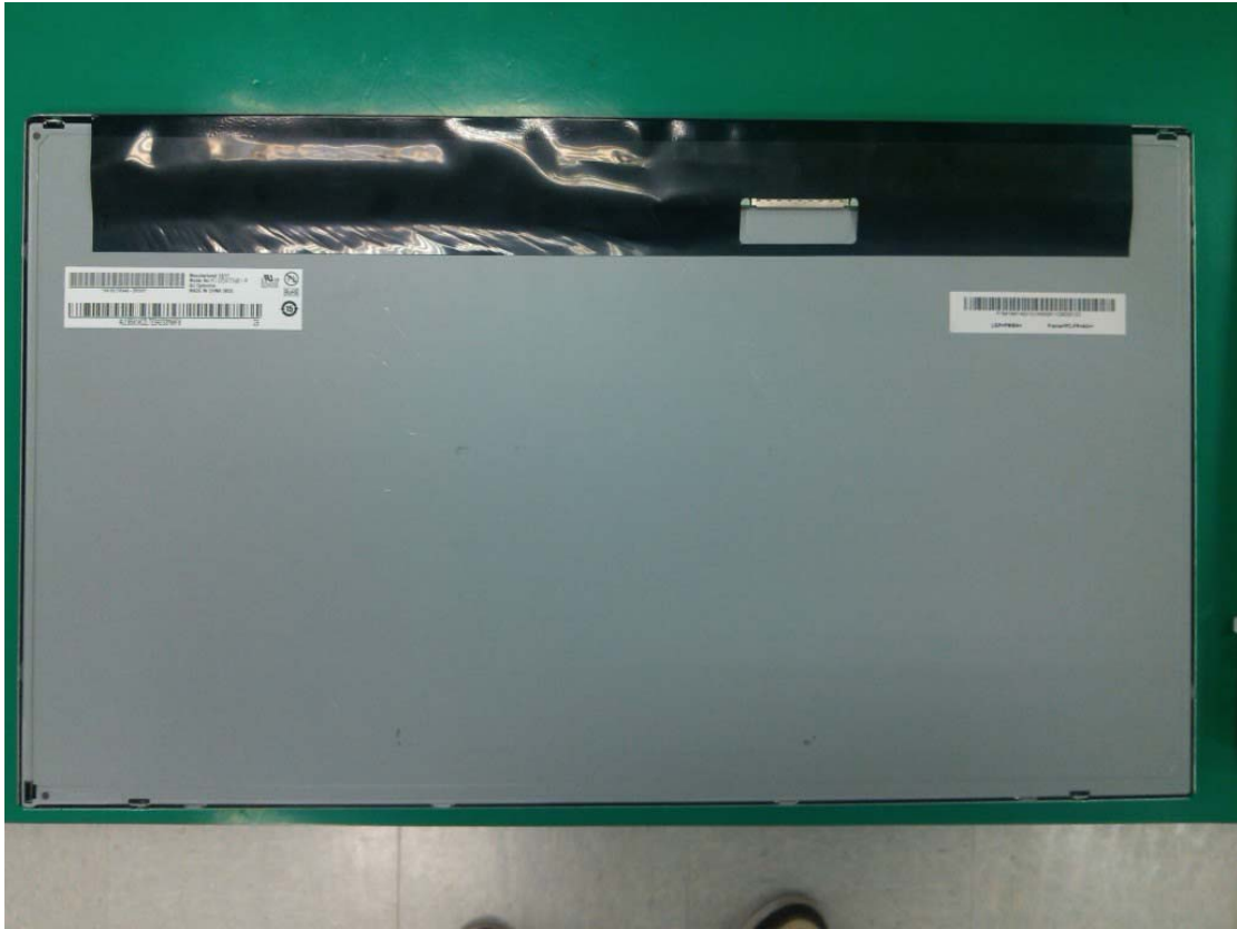
After change M195RTN01.0 Internal rear view