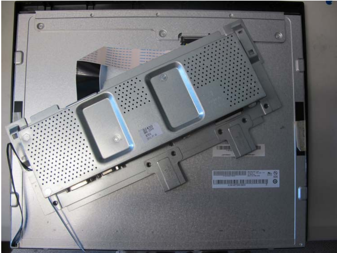
Back change M190EG02 rear view