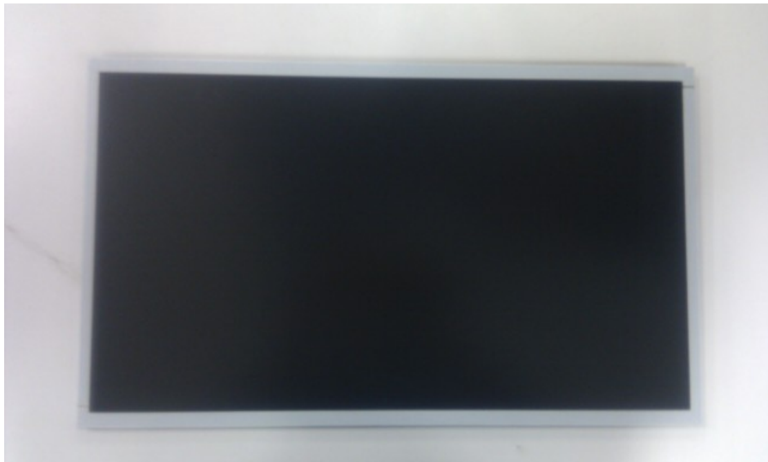
Back change M190EG02 front view