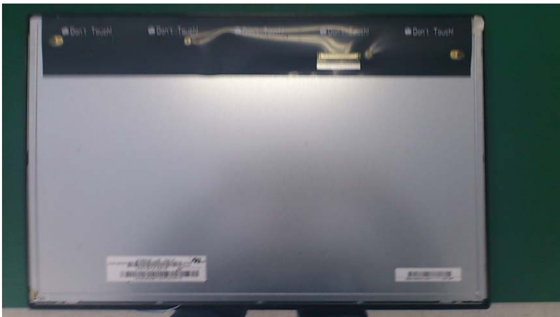
Before change M190CGE-L20 rear view