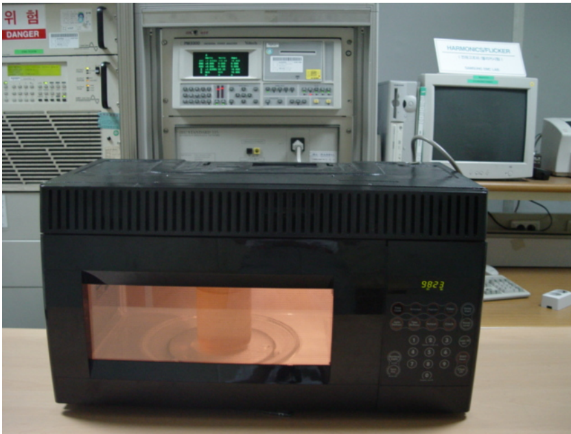
Fig.3 Test Setup for RF output power

The Caloric Method was used to determine maximum output power. The initial temperature of a 1000-ml water load was measured. The water load was placed in the center of the oven. The oven was operated at maximum output power for 120 seconds. Then the temperature of the water re-measured.