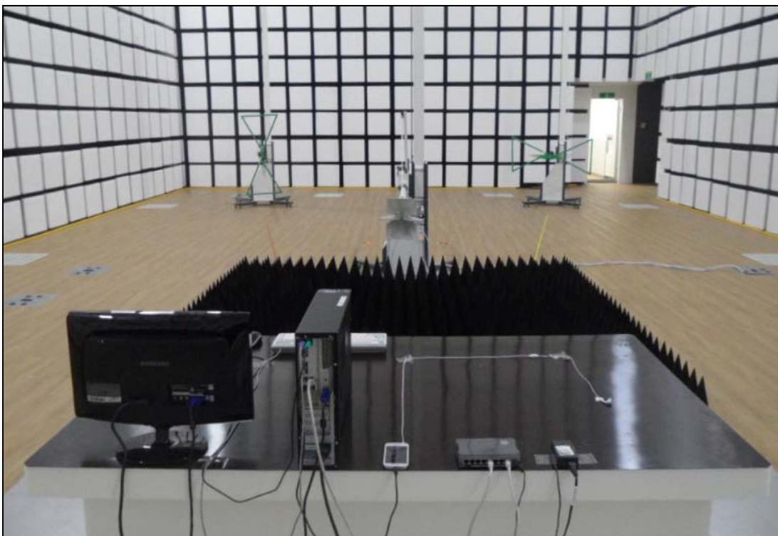
[ Radiated Disturbance for Above 1 GHz – Rear ]