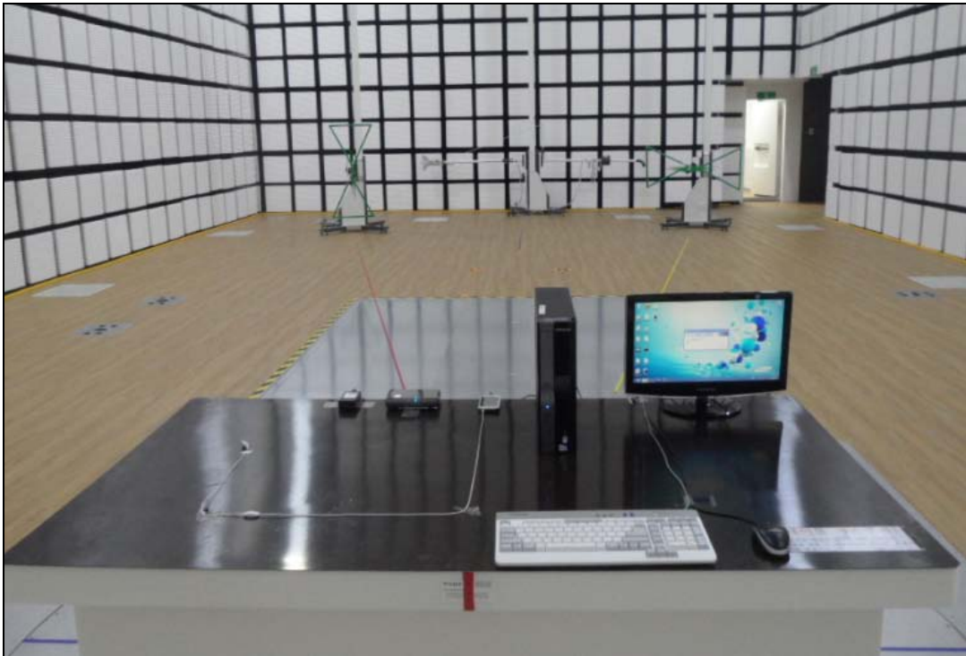
[ Radiated Disturbance for Below 1 GHz – Front ]