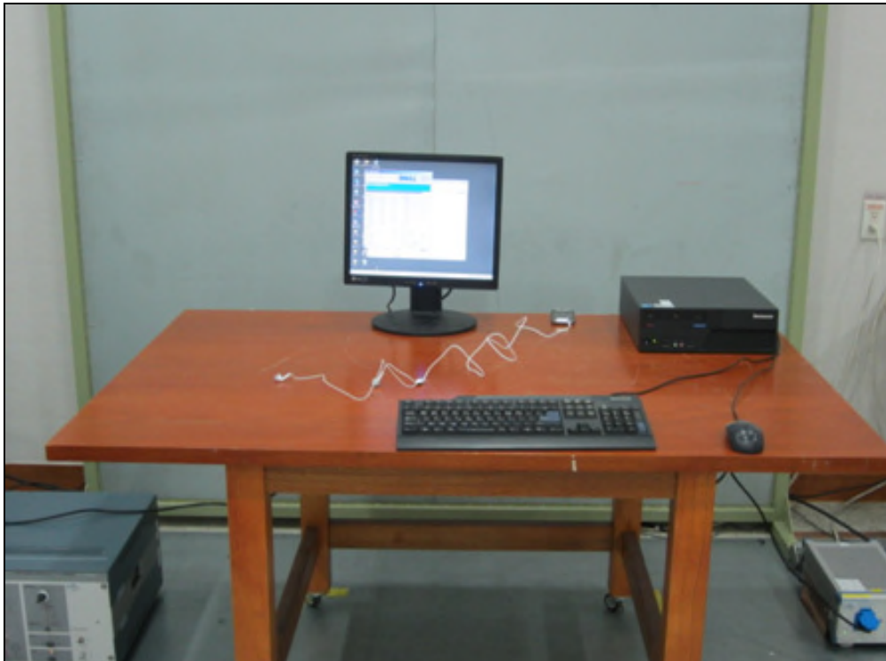
Photo of Conducted Emission