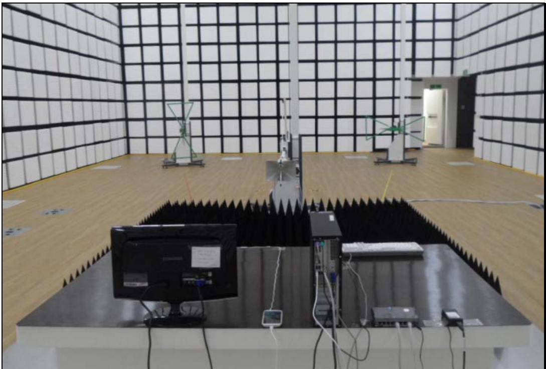
[ Radiated Disturbance for Above 1 GHz – Rear ]