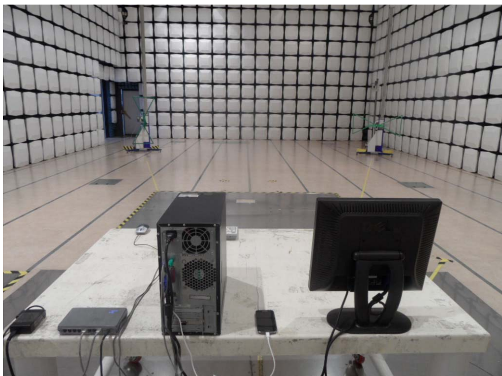
[ Radiated Disturbance for Below 1 GHz – Rear ]