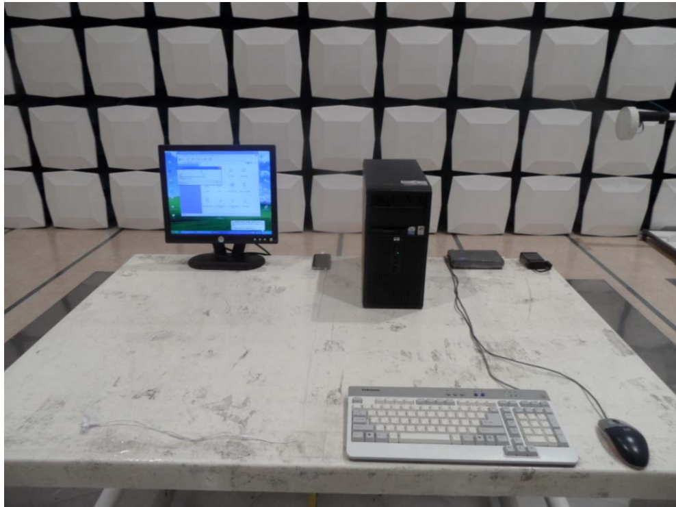
[ Radiated Disturbance for Below 1 GHz – Front ]