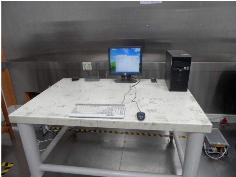
[ Conducted Disturbance – Front ]