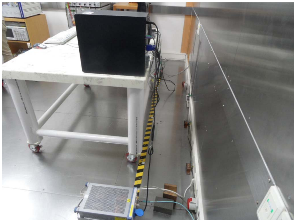
[ Conducted Disturbance – Rear ]