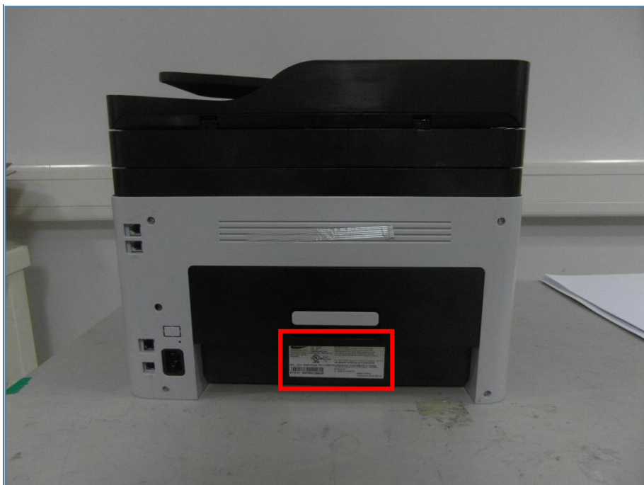
Rear View & Label location