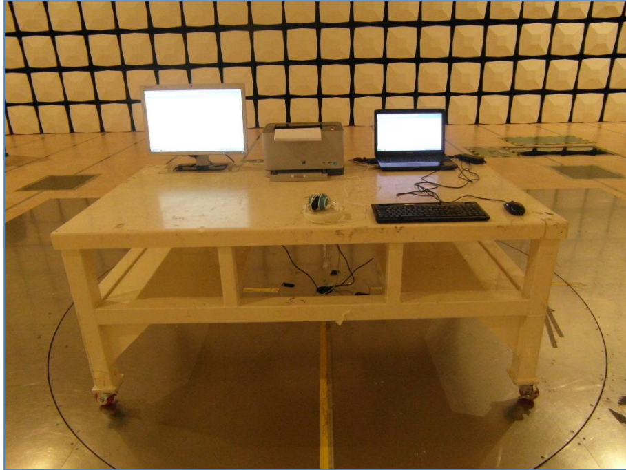
Front (Below 1GHz)