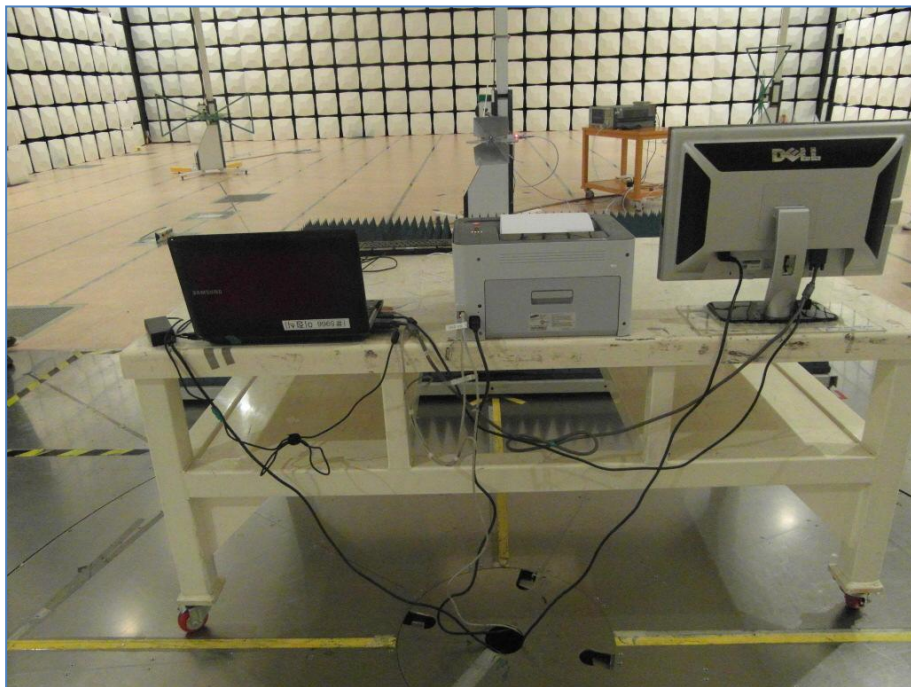
Rear (above 1GHz)