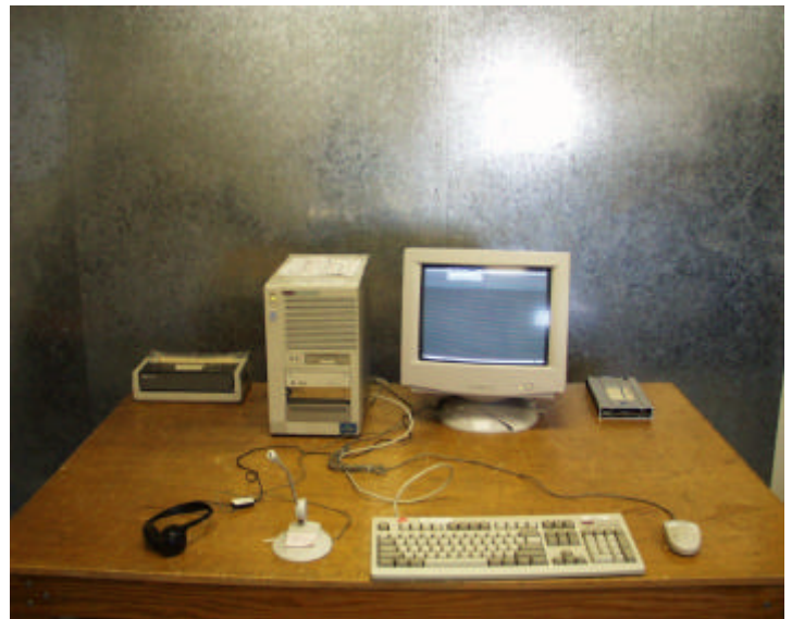
Conducted Emission Setup Photos (Worst Emission Position)