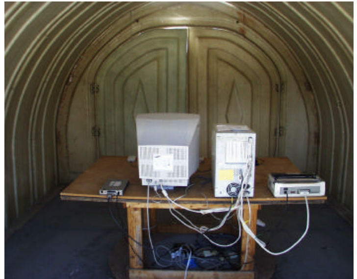
Radiated Emission Setup Photos (Worst Emission Position)