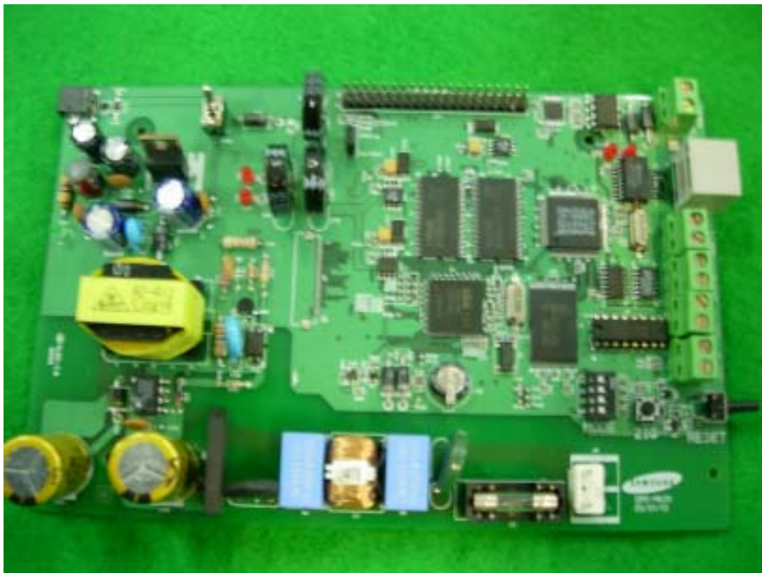
<FRONT SIDE OF MAIN BOARD>