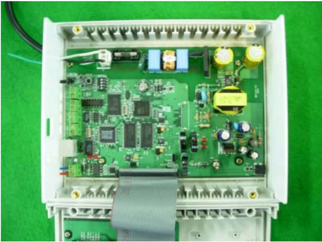
<INNER SIDE OF EUT>