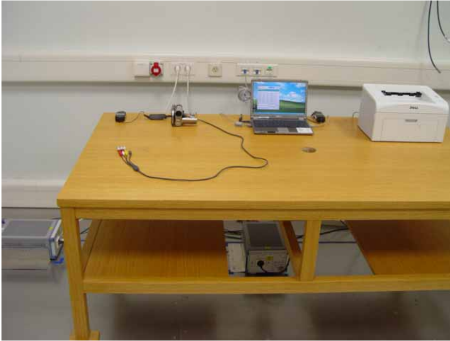
Picture 1. Conducted emission