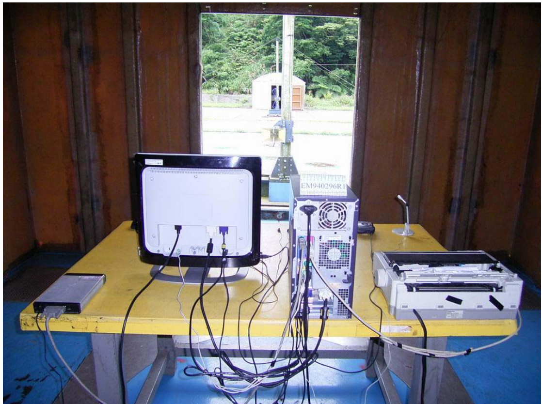
BACK VIEW OF RADIATED MEASUREMENT