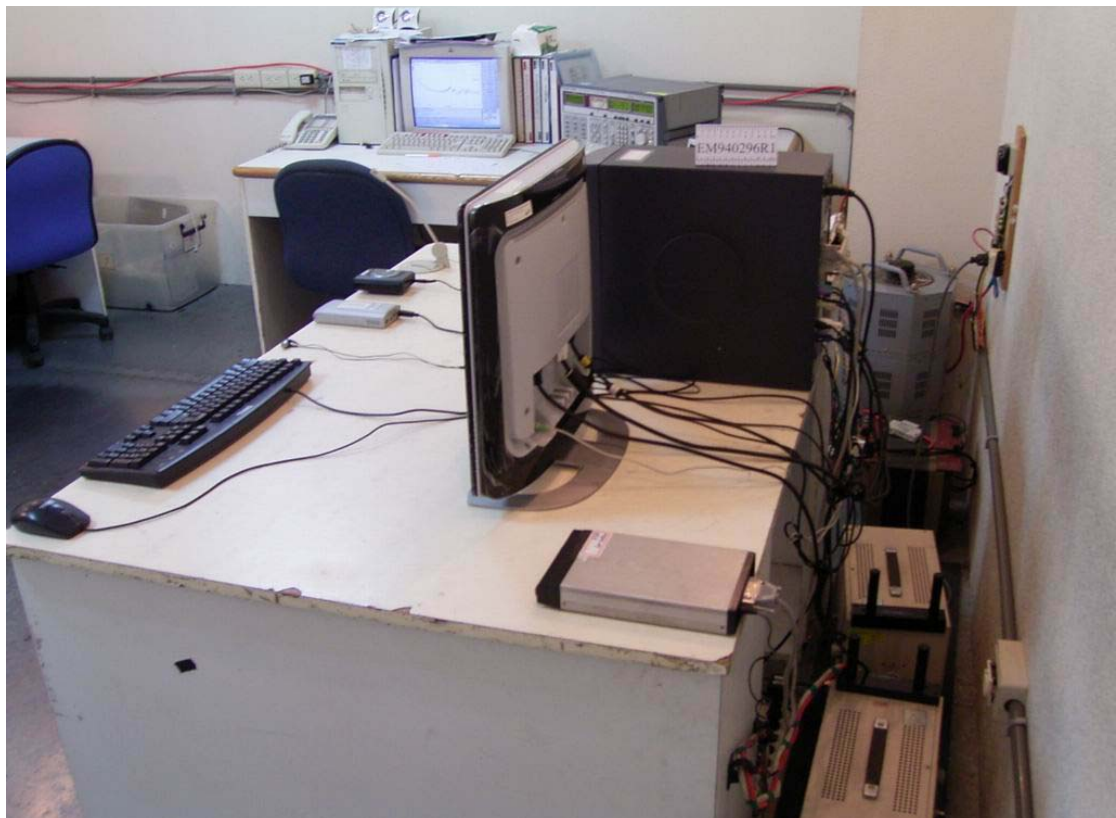
BACK VIEW OF CONDUCTED MEASUREMENT