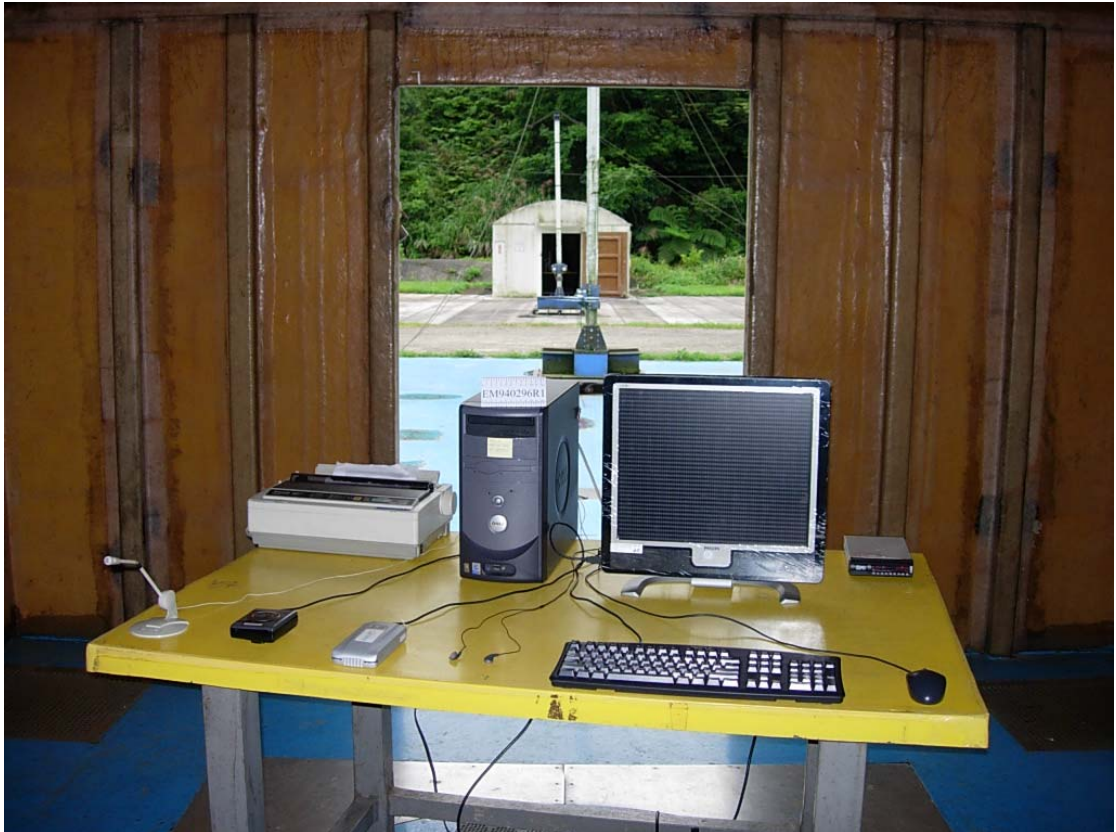
SETUP WITH MAXIMUM DETECTED EMISSION AT HORIZONTAL POLARIZATION

Test Mode : 1024*768/75Hz, 61kHz, DVI Cable