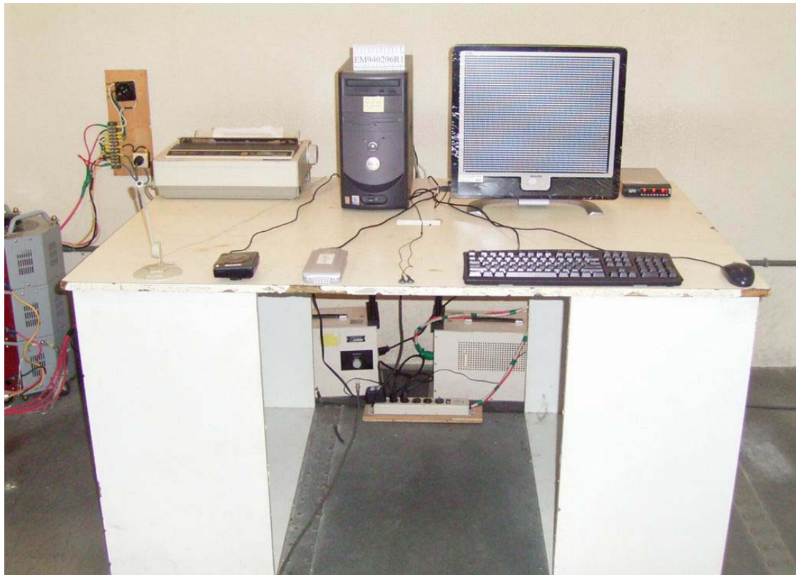
FRONT VIEW OF CONDUCTED MEASUREMENT