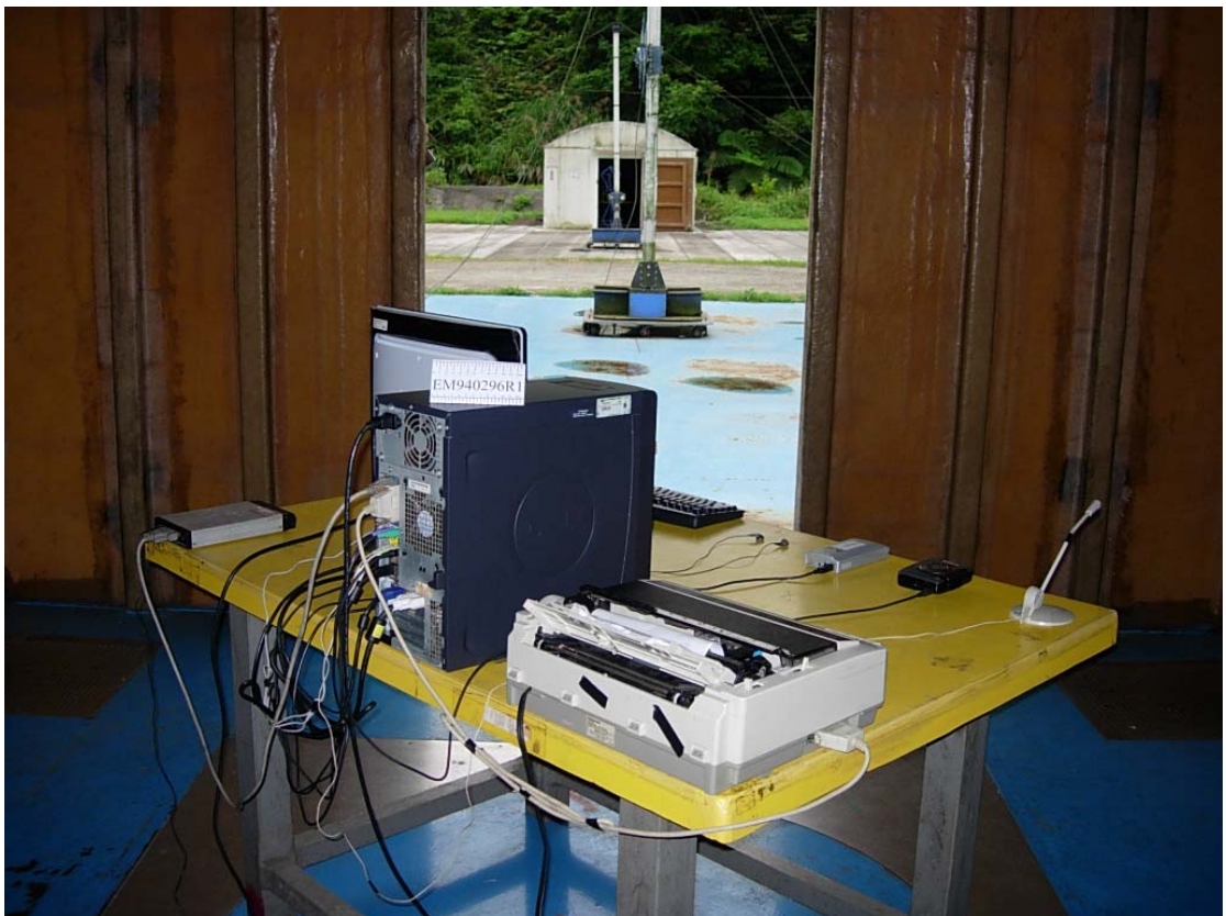
SETUP WITH MAXIMUM DETECTED EMISSION AT VERTICAL POLARIZATION