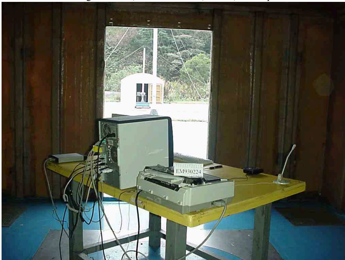
SETUP WITH MAXIMUM DETECTED EMISSION AT HORIZONTAL POLARIZATION

Test Mode : w/Chunghwa Panel, 1024*768/75Hz, 60kHz, DVI Input