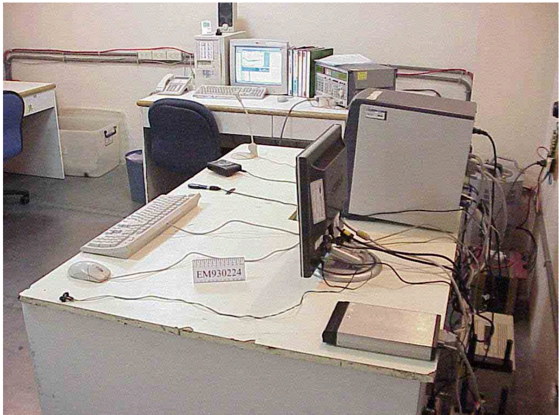
BACK VIEW OF CONDUCTED MEASUREMENT