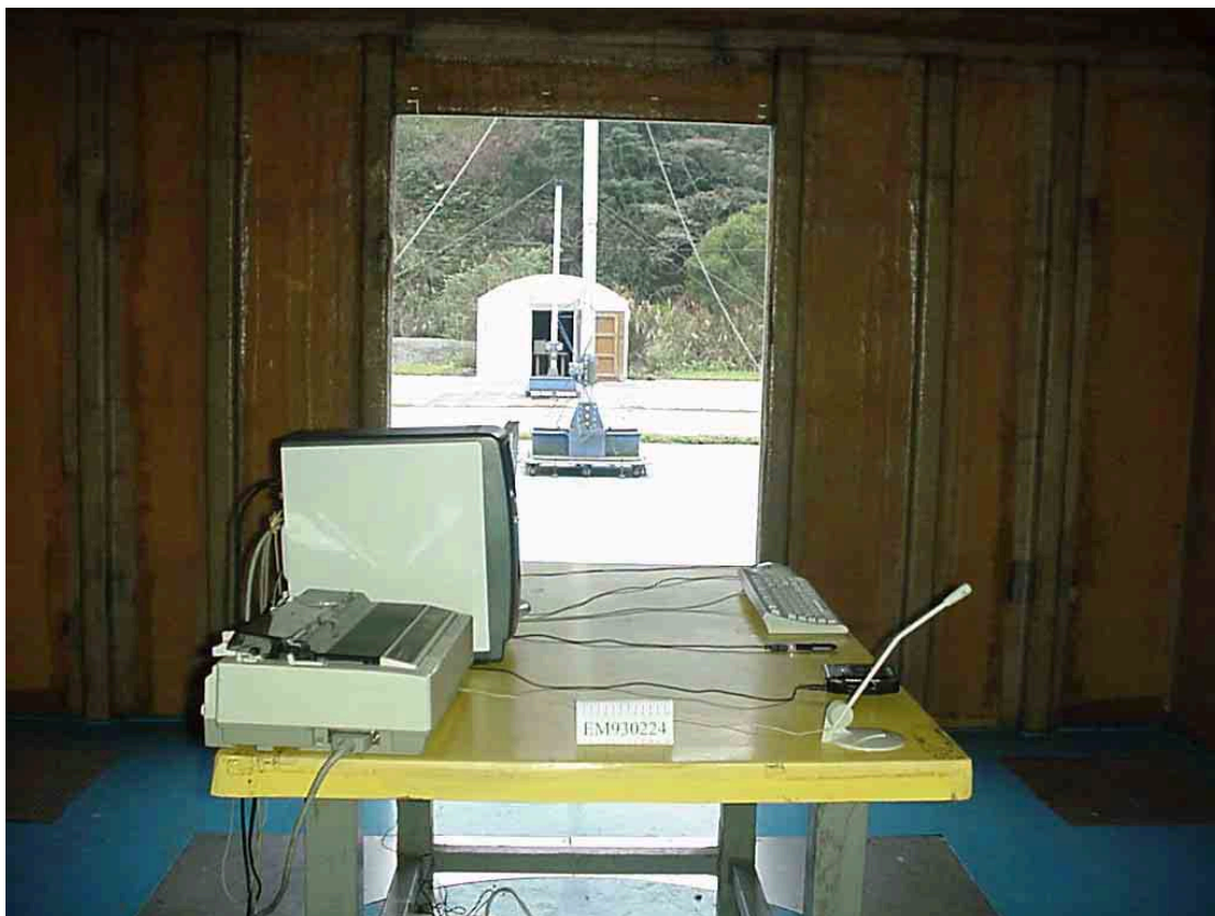
SETUP WITH MAXIMUM DETECTED EMISSION AT VERTICAL POLARIZATION