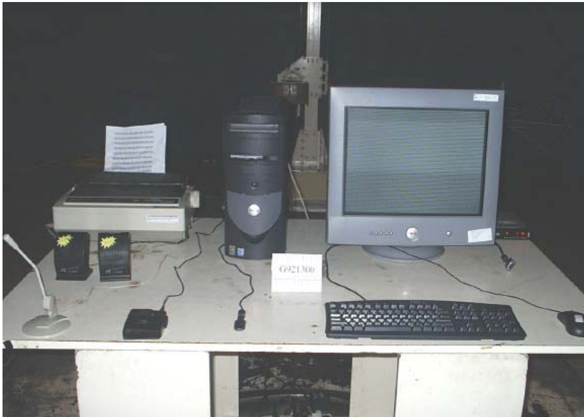
FRONT VIEW OF RADIATED TEST