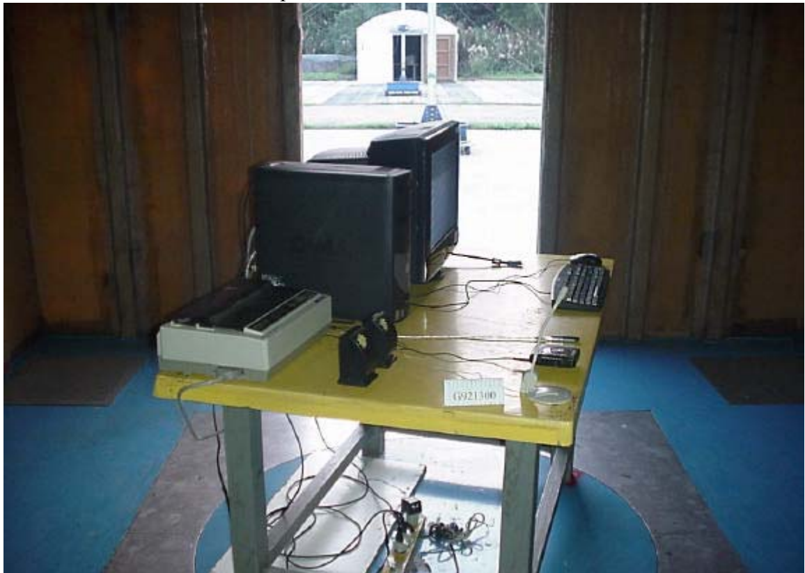
SETUP WITH MAXIMUM DETECTED EMISSION AT HORIZONTAL POLARIZATION

Test Mode: D-Sub 1 Input, 1600*1200/85Hz, 106.5kHz