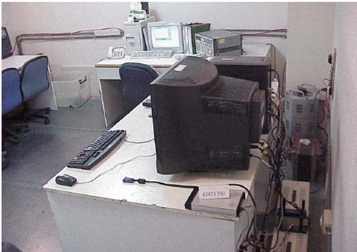
BACK VIEW OF CONDUCTED TEST