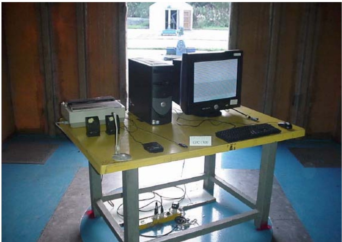
SETUP WITH MAXIMUM DETECTED EMISSION AT VERTICAL POLARIZATION