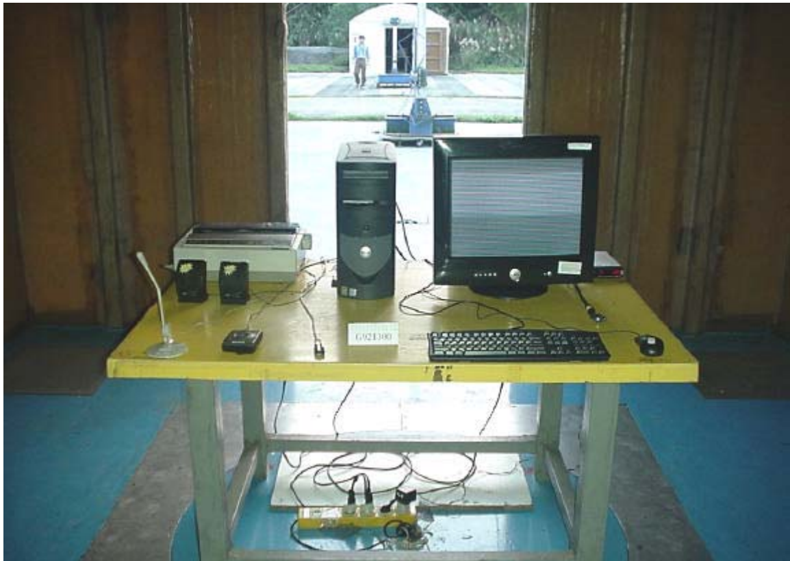
FRONT VIEW OF RADIATED TEST