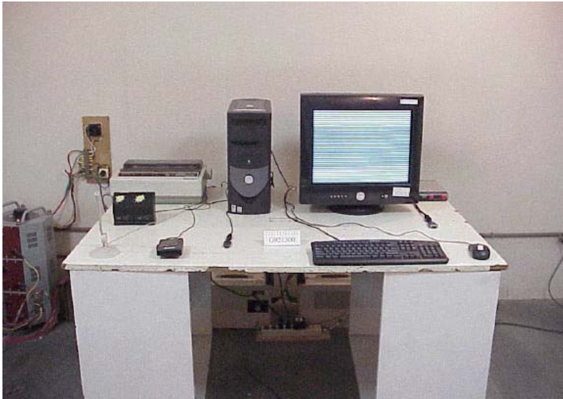
FRONT VIEW OF CONDUCTED TEST