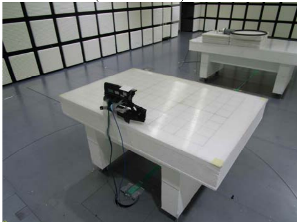
Rear (Below 30 MHz) Horizontal