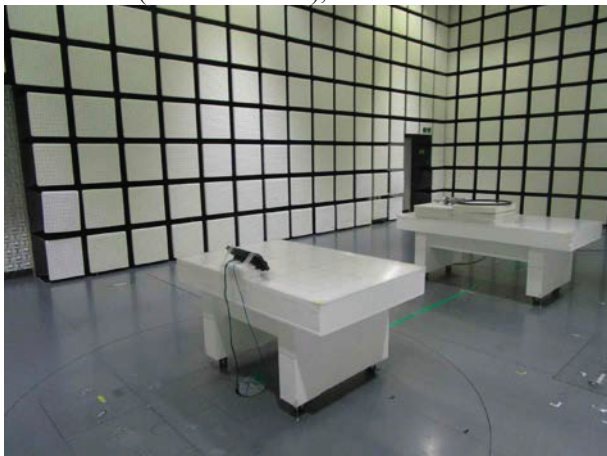
Rear (Below 30 MHz), Antenna: Horizontal