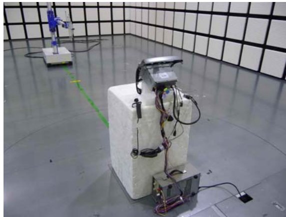
(Rear, below 1GHz)