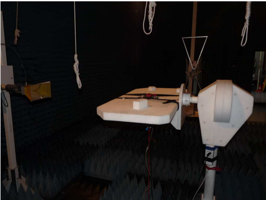
Photo 3: Test setup for radiated measurements (above 1 GHz), FCC 15.247