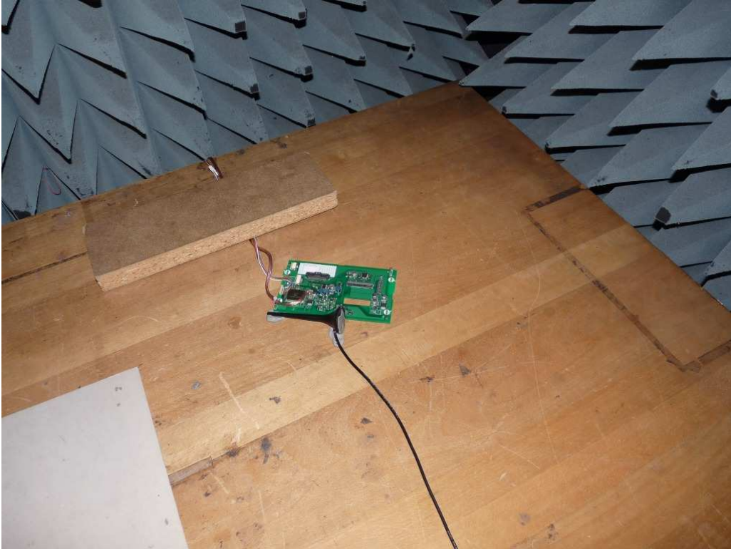
Photo 1: Test setup for radiated measurements (below 30 MHz), FCC 15.247