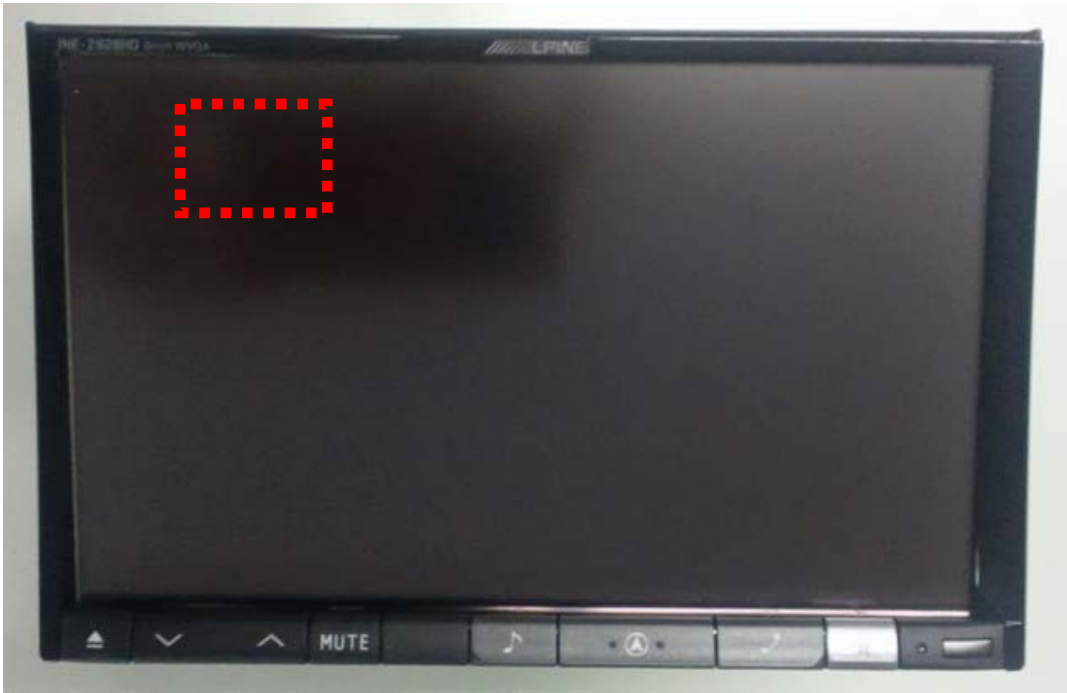
Fig 2. Front View of Display unit that installed Bluetooth Transmitter “UGZZC-B###”