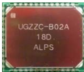
Fig 1. Top View of Bluetooth Transmitter “UGZC-B###”