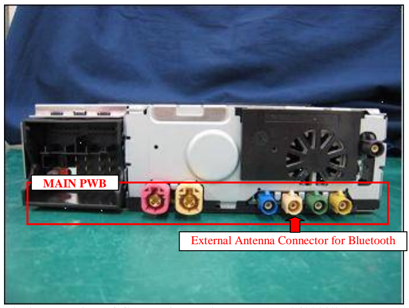
Fig 3. Rear view of Car audio that installed "PF240028" (Example)

There isn't an official user manual for this Bluetooth Module "PF240028". However, user manuals of final product, which have the module, must contain notification corresponding to the following description.