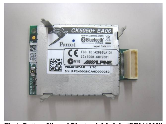
Fig 1. Bottom View of Bluetooth Module "PF240028"