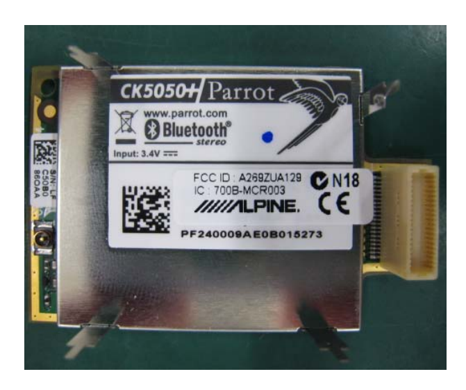
Fig 1. Bottom View of Bluetooth Module "PF240009"