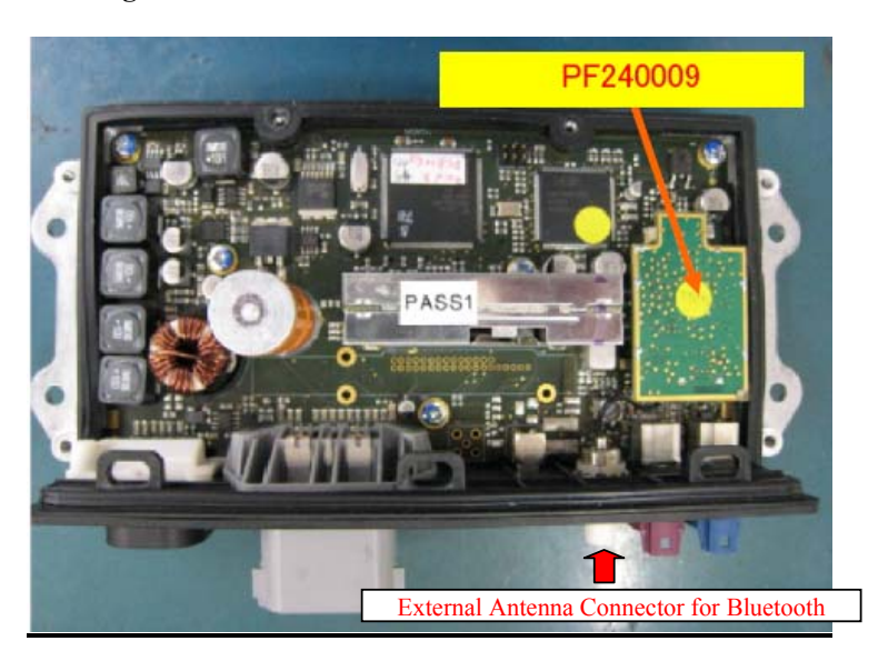
Fig 2. Top View of MAIN PWB that installed Bluetooth Module "PF240009"