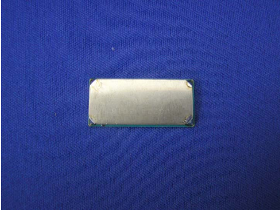
Front with Shield