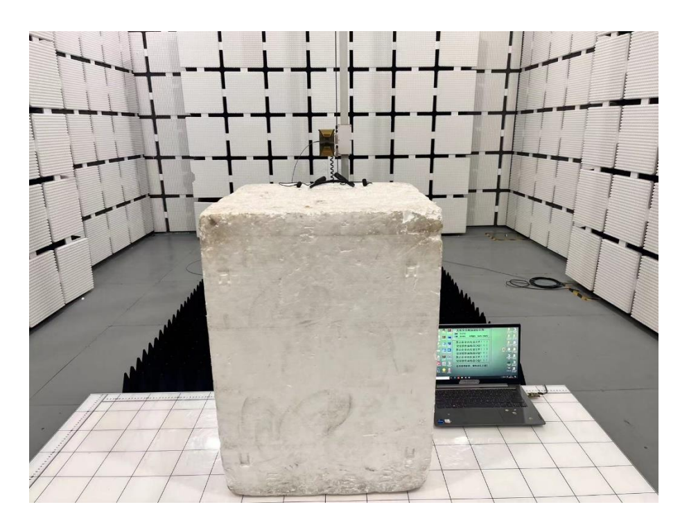
Set-up for Radiated Spurious Emission, Above 1GHz