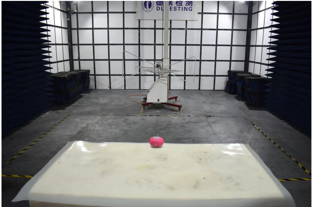
Radiated Measurement Photos