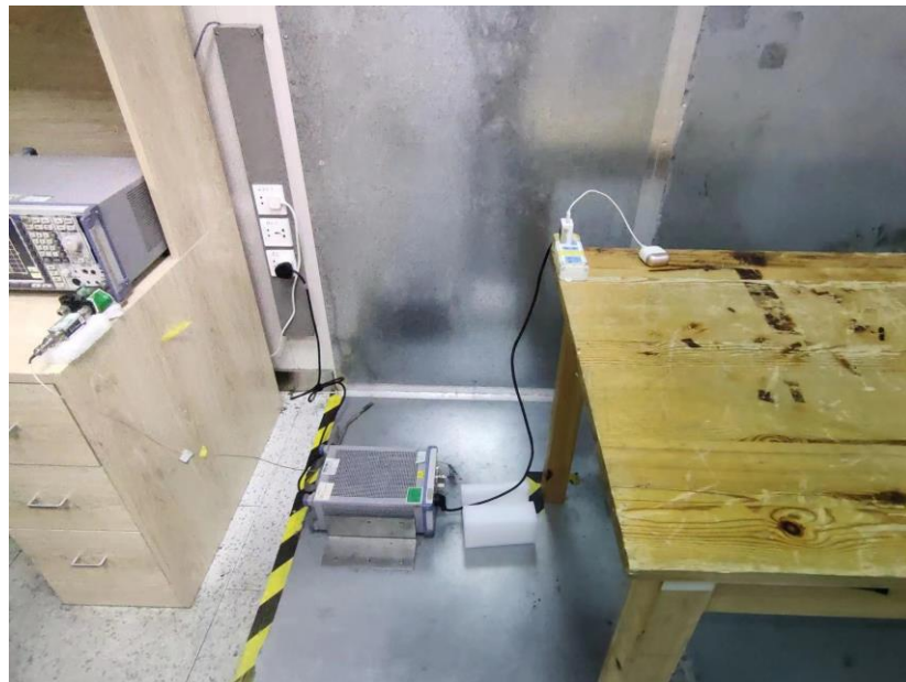
Radiated Emissions From 30M-1GHz