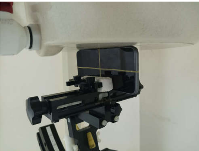
Left Side, Test Separation 0 mm