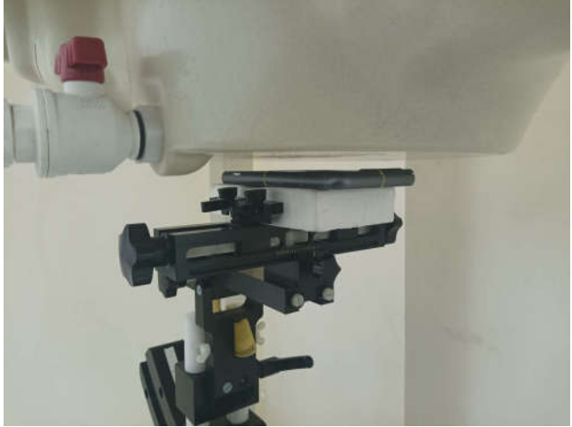
Back, Test Separation 10 mm