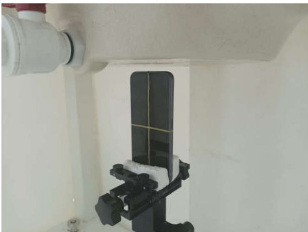
Top Side, Test Separation 10 mm