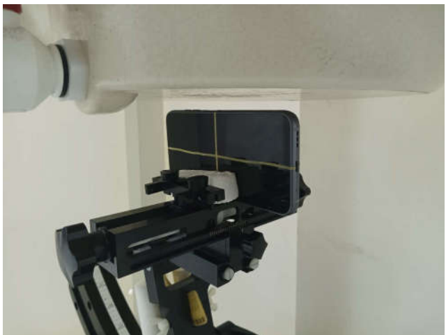
Right Side, Test Separation 10 mm