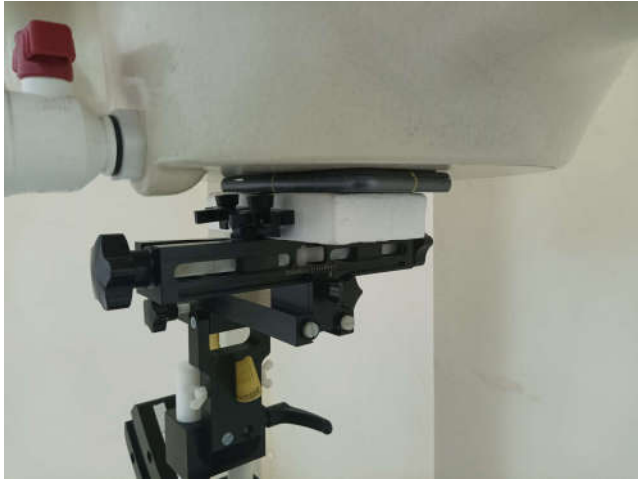
Back, Test Separation 0 mm