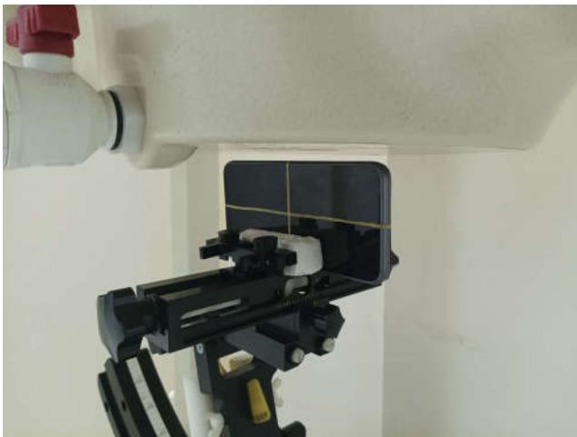
Left Side, Test Separation 10 mm