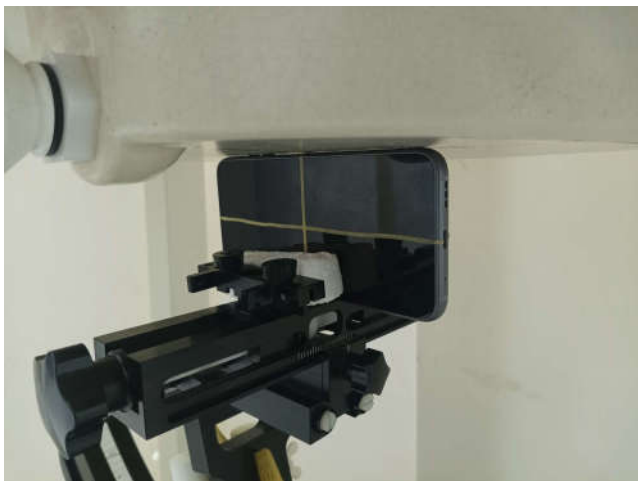
Right Side, Test Separation 0 mm