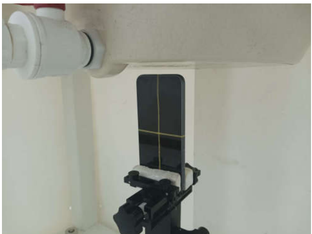
Bottom Side, Test Separation 10 mm