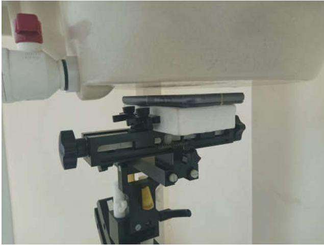
Front, Test Separation 10 mm