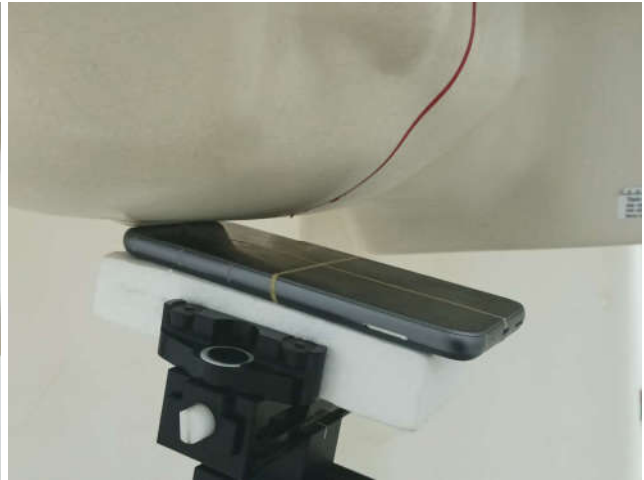
Right Tilted, Test Separation 0 mm