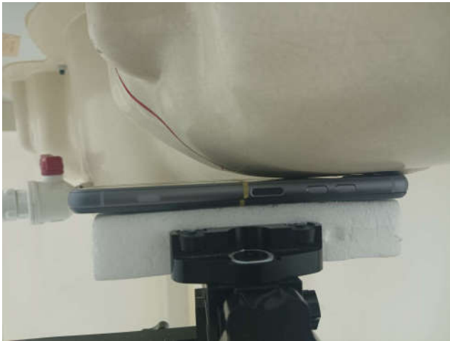
Left Cheek, Test Separation 0 mm