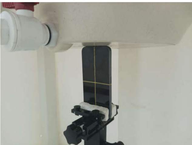
Top Side, Test Separation 0 mm