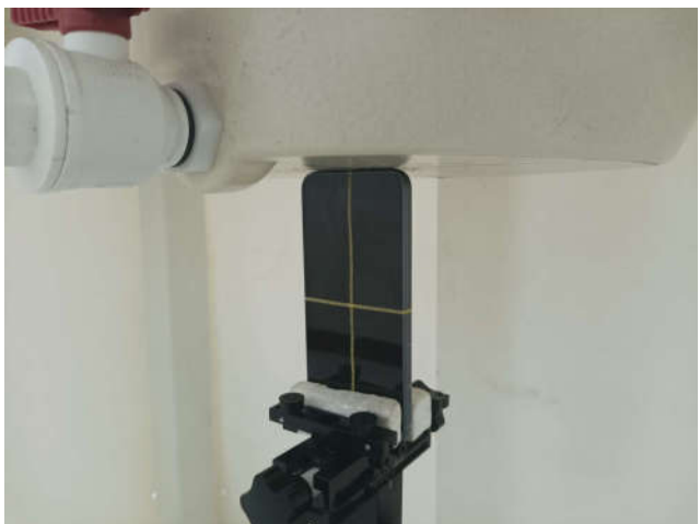
Bottom Side, Test Separation 0 mm