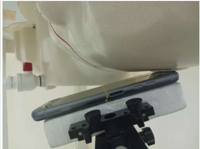
Left Tilted, Test Separation 0 mm