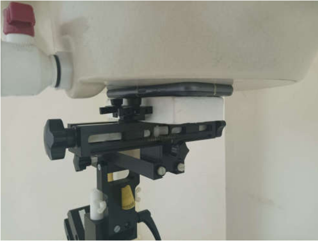
Front, Test Separation 0 mm