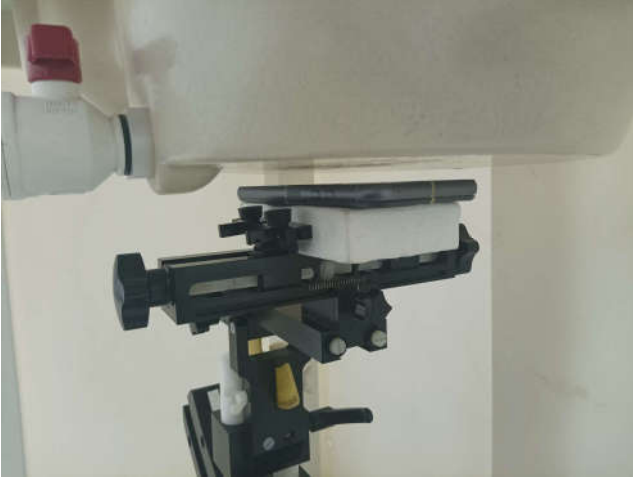
Front, Test Separation 10 mm