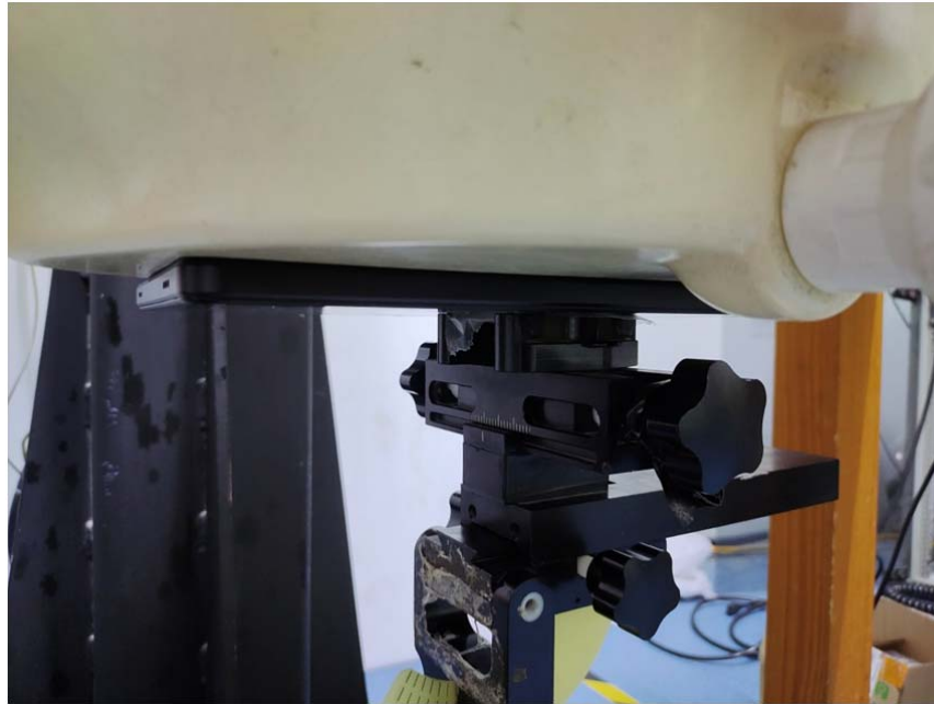
Body Left Setup Photo (0mm)