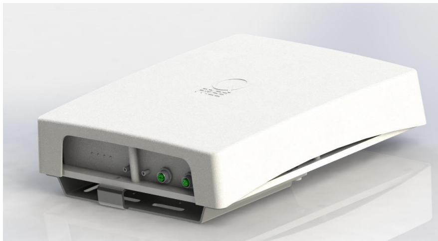
Figure 1 ITS-950 Base Station