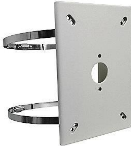
Figure 3 Pole Mount Kit

The ITS-950 ParQSense Base Station will be provided with a pole mount kit. This can be used for mounting the ITS-950 ParQSense Base Station to the proposed pole location.