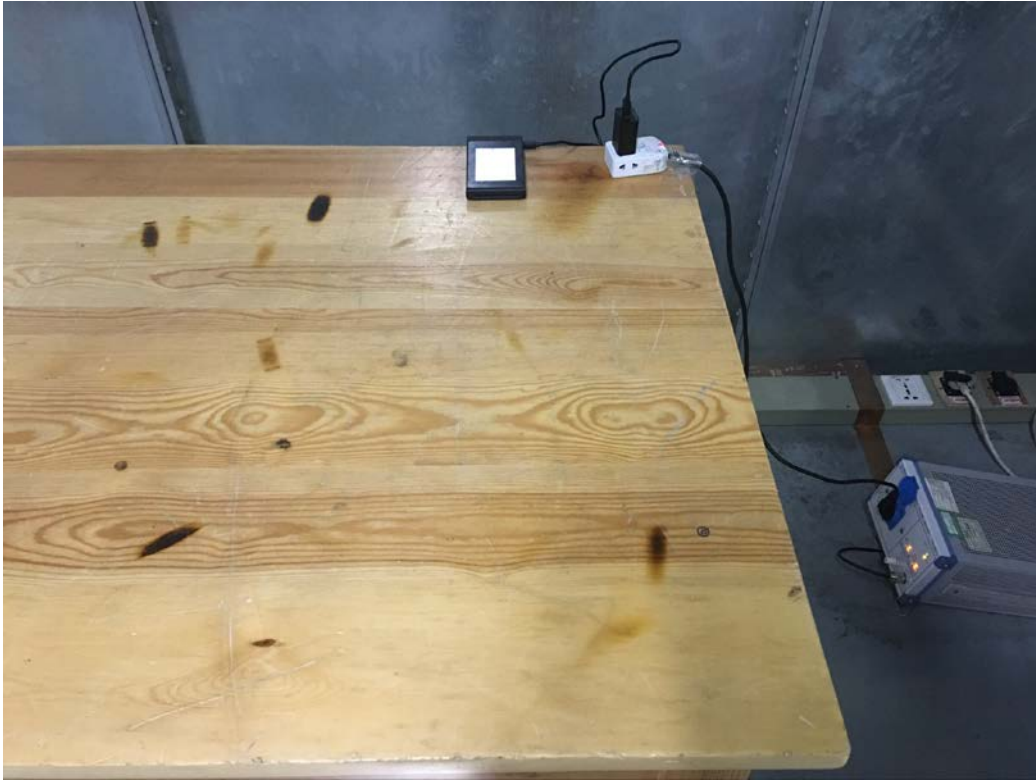
Conducted emission-Adapter charging