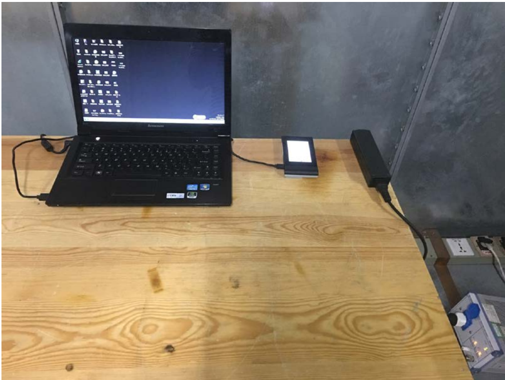
Conducted emission-PC USB port charging