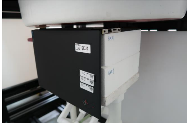
Bottom of Laptop, Test Separation 14 mm