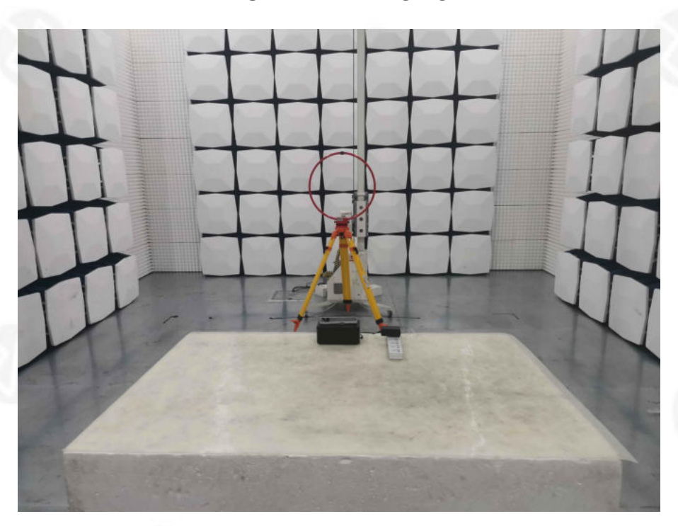
Low-frequency radiation(Below 30MHz)