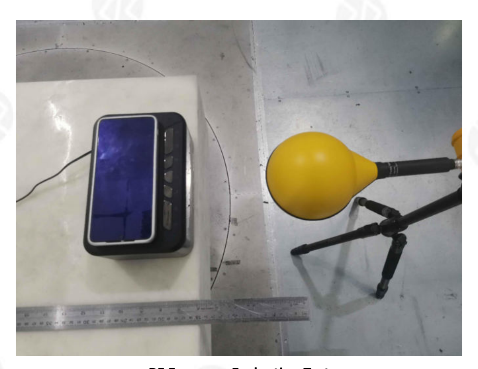
RF Exposure Evaluation Test