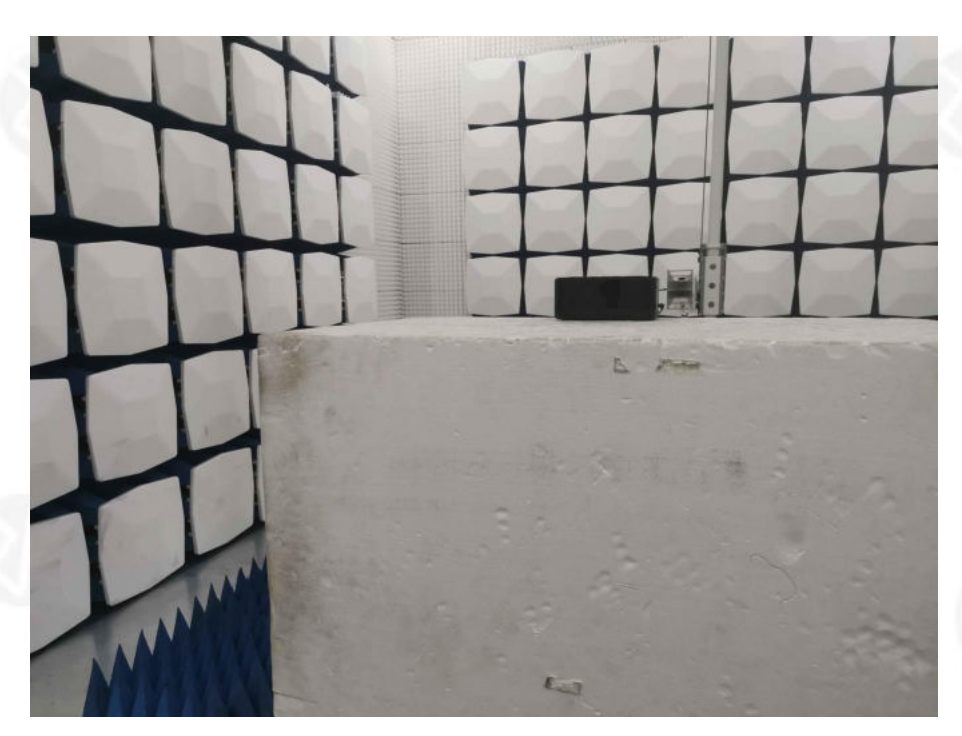
High frequency radiation (Above 1G)