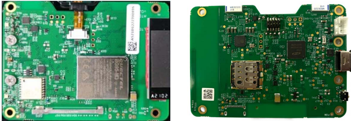
Figure 5.1 PCBA board