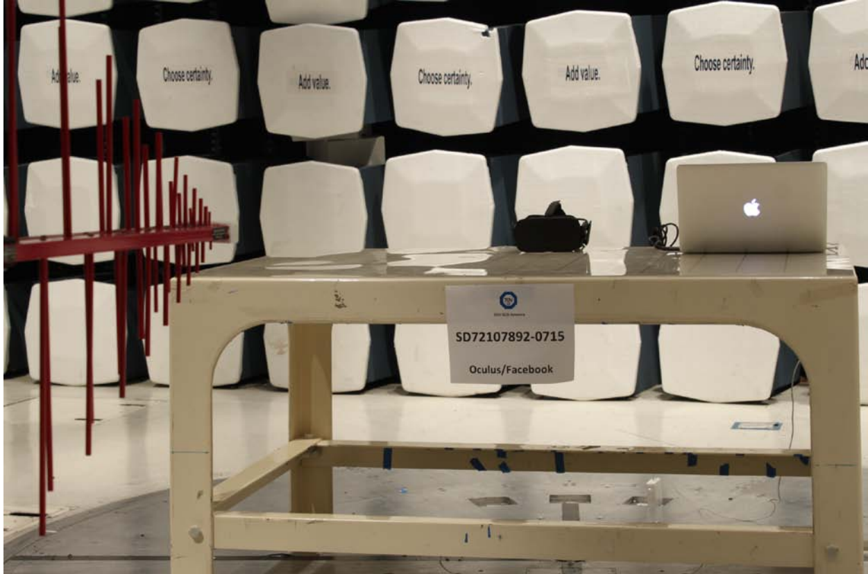
Radiated Emissions Test Setup (below 1GHz)