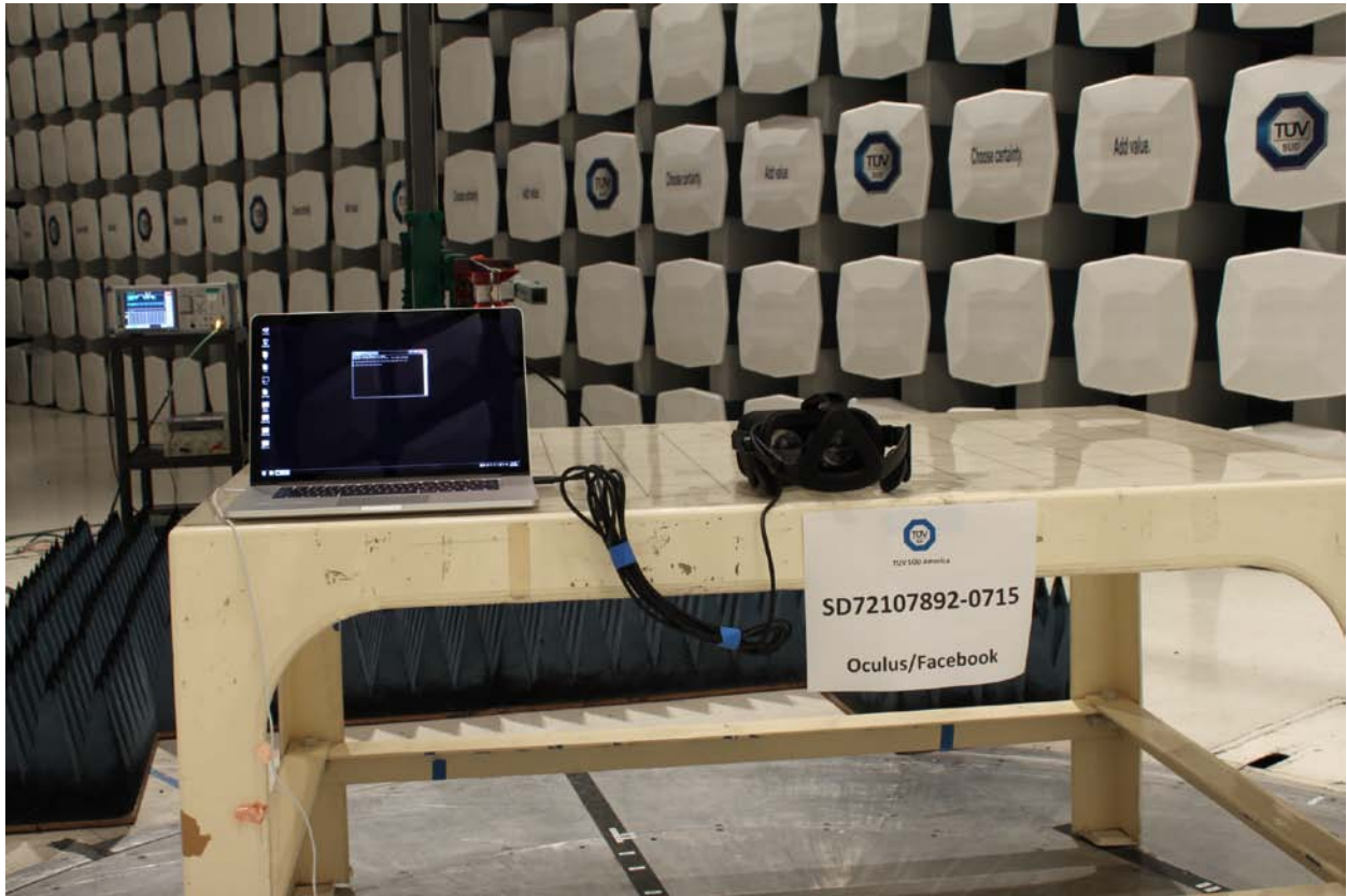
Radiated Emissions Test Setup (above 1GHz)