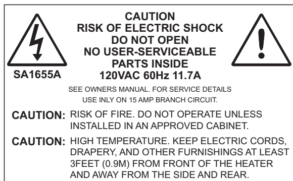
电擊警告標 Label size: 130mm x 80mm 白底黑字

This device complies with part 15 of FCC Rules. Operation is subject to the following two conditions; (1) This device may not cause harmful interference, and (2) this device must accept any interference received, including interference that may cause undesired operation.