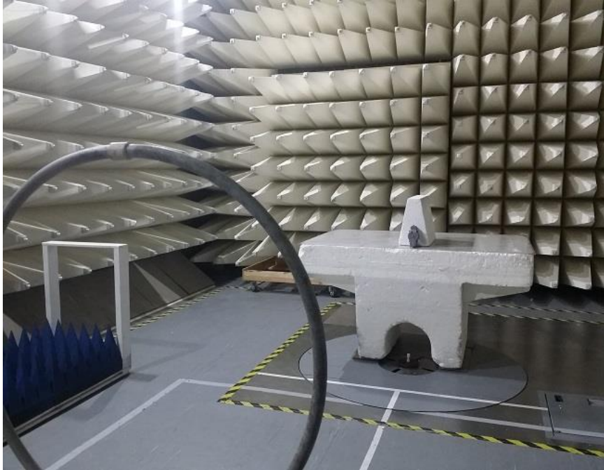
Photograph No.1 Setup for spurious emission field strength measurements in the anechoic chamber below 30 MHz