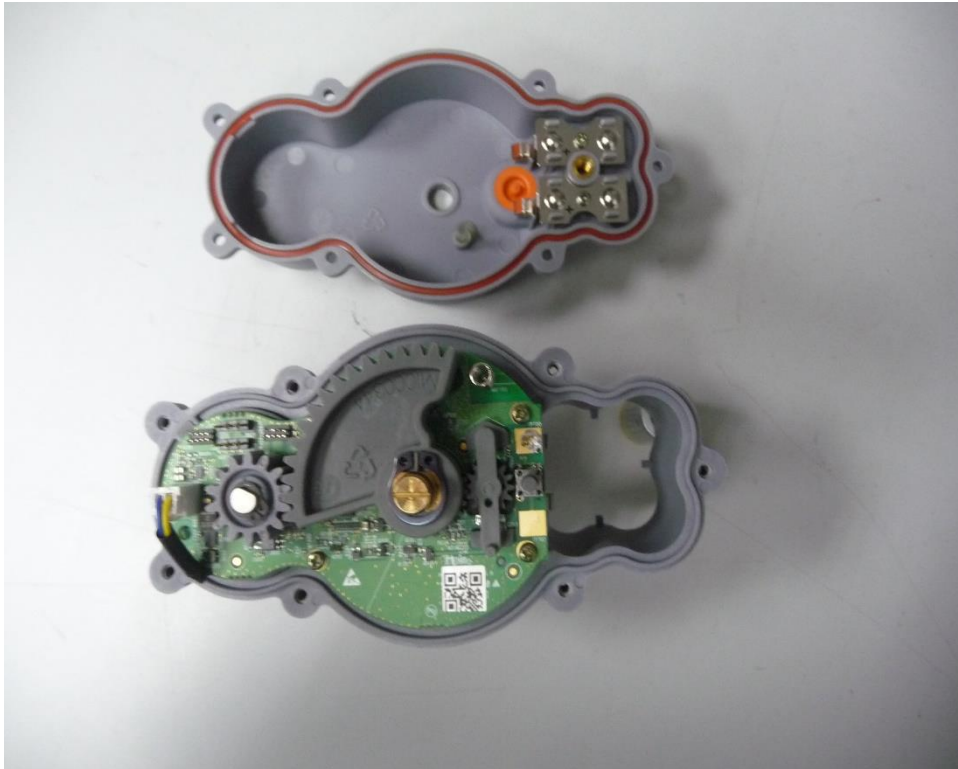
Photograph No.1 Actuator shut off unit internal view