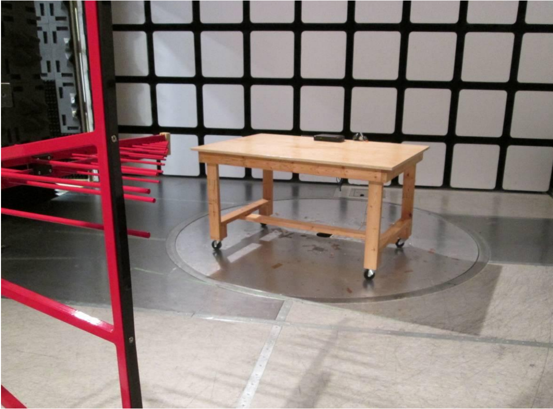
Photo 1. Radiated Emissions 1