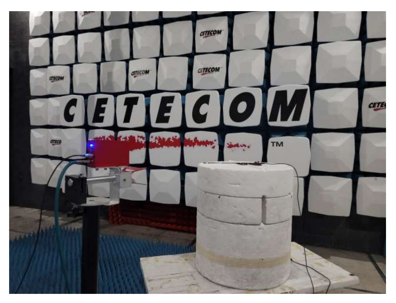
18 GHz to 26 GHz